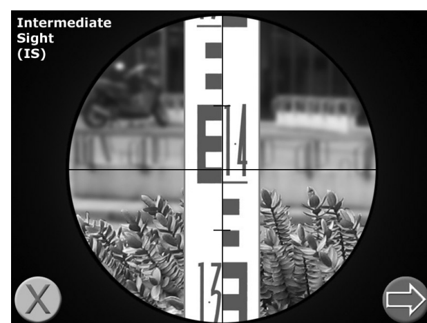
Figure 1: Virtual levelling exercise

A first-year BSc (Hons) Construction Management student commented: