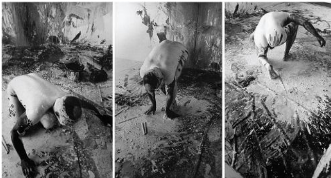
Figure 2. Stuart Brisley, Moments of Decision / Indecision , 1975, Photographs by Leslie Haslam. Copyright of the artist.