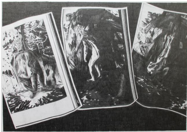
Figure 3. Kiff Bamford, Decision / Decyzja after Brisley , Pencil on Paper, 2014