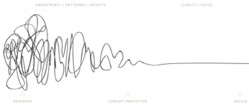
Figure 1: The Process Design Squiggle by Damien Newman

The first step in the process is to build empathy and the designers are directed to begin by setting aside pre-conceptions and knowledge of existing solutions. Damien Newman's squiggle illustration [9] captures this mindset and in particular the almost chaotic early stages of a Design Thinking approach: