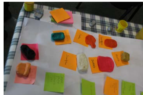
Figure 4: Modeling Measurement Activity

Participants were given Play-Doh, a modeling compound usually played with by children, and invited to model the means by which they tracked their weight. Whilst the output was limited, the aim of this approach was to re-ignite the energy within the room and drive engagement by adding an increased sense of fun.