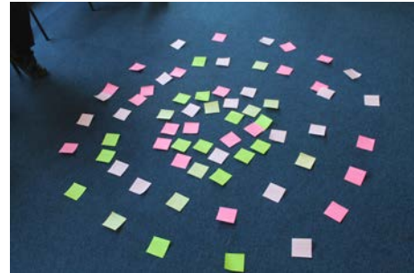
Figure 3: Circles of Influence Activity

them such as family and friends; then widening their thinking to their environment such as neighbors, work colleagues and their local physical environment. Finally considering influences at the wider societal level, such as media and politics. All thoughts were captured on either pink (negative) or green (positive) post-it notes and organized in concentric circles to build a picture of these influences. Again there was a short pause to reflect on the output, particularly the mix of colors that developed.