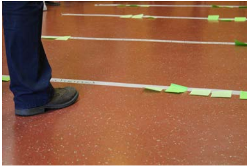
Figure 5: Hurdles and Drivers Activity

they perceived others had experienced when seeking to lose weight. Suggestions were captured on strips of masking tape that were placed on the floor to simulate hurdles; a workshop facilitator was then positioned by the hurdle and the participants were asked to offer ways in which the hurdle could be confronted or overcome. With the facilitator needing 5 suggestions to move on before another hurdle was requested.