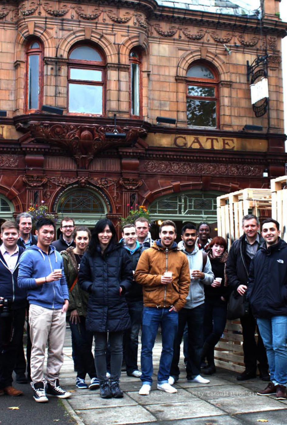
Tea Shop Community Consultation day