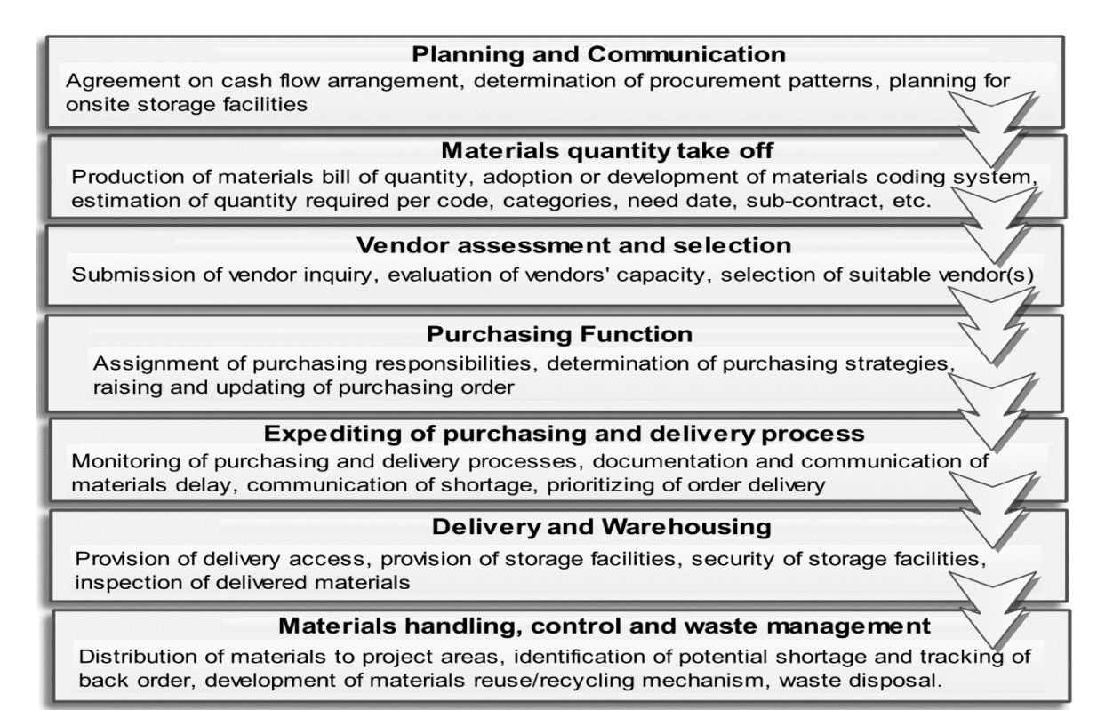
Figure 1: Key stages of materials logistics management in construction projects

usually involves a number of stages including materials take-off, bill of materials, warehousing and the actual use of the materials. At the early stage, an effort is required to ensure that the materials take-off is accurately made from project specification in order to prevent error in ordering (Bell and Stukhart, 1986). The increasing use of Computer Aided Design (CAD), and specifically the use of BIM tools for materials take-off, is continuously facilitating efficient estimation of materials required for building activities. Nonetheless, this largely depends on the accuracy of the drawing documents and adequate coordination of drawings between various professional parties involved in modern-day designs (Monteiro and Martins, 2014).