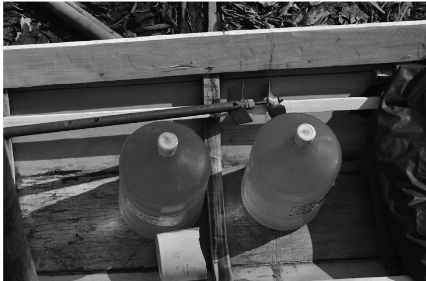
Figure 4. Bottled water supplements drinking water during periods of low rainfall.