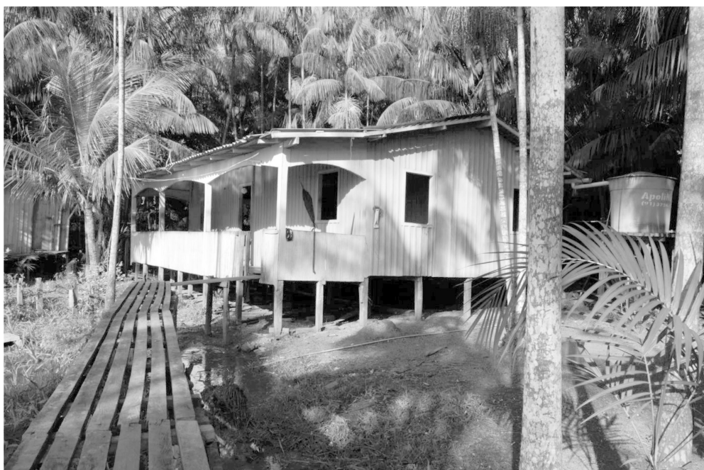
Figure 1. A raised walkway leading up to a house on stilts (Note: when the tide is high, the water reaches far beneath the building)

The close proximity to the sea means the vast river which surrounds Paquetá and neighbouring islands is tidal. As such, individual and small clusters of households which are predominately located along the island shores and interior waterways are built on stilts. Raised walkways lead up from the river and connect clusters of buildings, or lead to separate toilet blocks that are located away from the main structures (Figure 1).