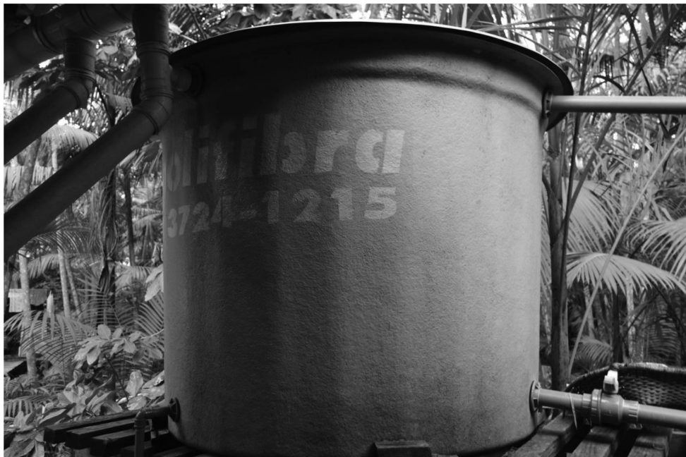
Figure 2. Rainwater harvesting installation on Jutuba

Unlike the activities and public services listed above, the provision of drinking water has the potential to be independent from the tidal cycle of the river. The island of Cotijuba, which is more developed, has a borehole that supplies the island with drinking water, as well as grid electricity and road infrastructure. However, on Paquetá and other islands access to clean water remains a challenge. In these areas, the dispersed location of households means that off-grid solutions are likely to be the most appropriate solution for the provision of drinking water. This is already reflected by the widespread use of water infrastructure that collects river and/or rainwater at the household level. Those living on the islands of Arapiranga, Mucura and Onças depend on river water for decentralised supply at household level which is pumped into raised tanks and distributed using gravitational force. Discussions with the local community indicated that common health issues on Arapiranga include vomiting and diarrhea. It is likely that these problems are linked to the poor quality of their drinking water, though people across the islands also regularly come into contact with river water when they bathe in it.