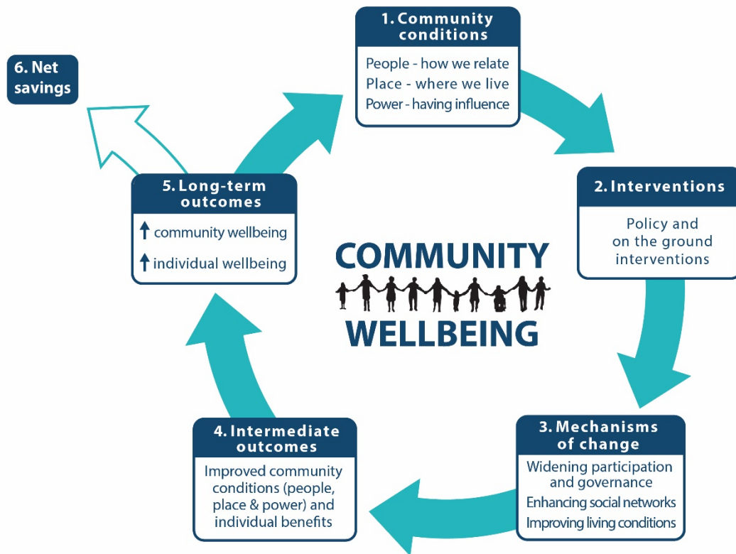
Figure 2 Theory of change of what works to increase community wellbeing (South et al. 2017)