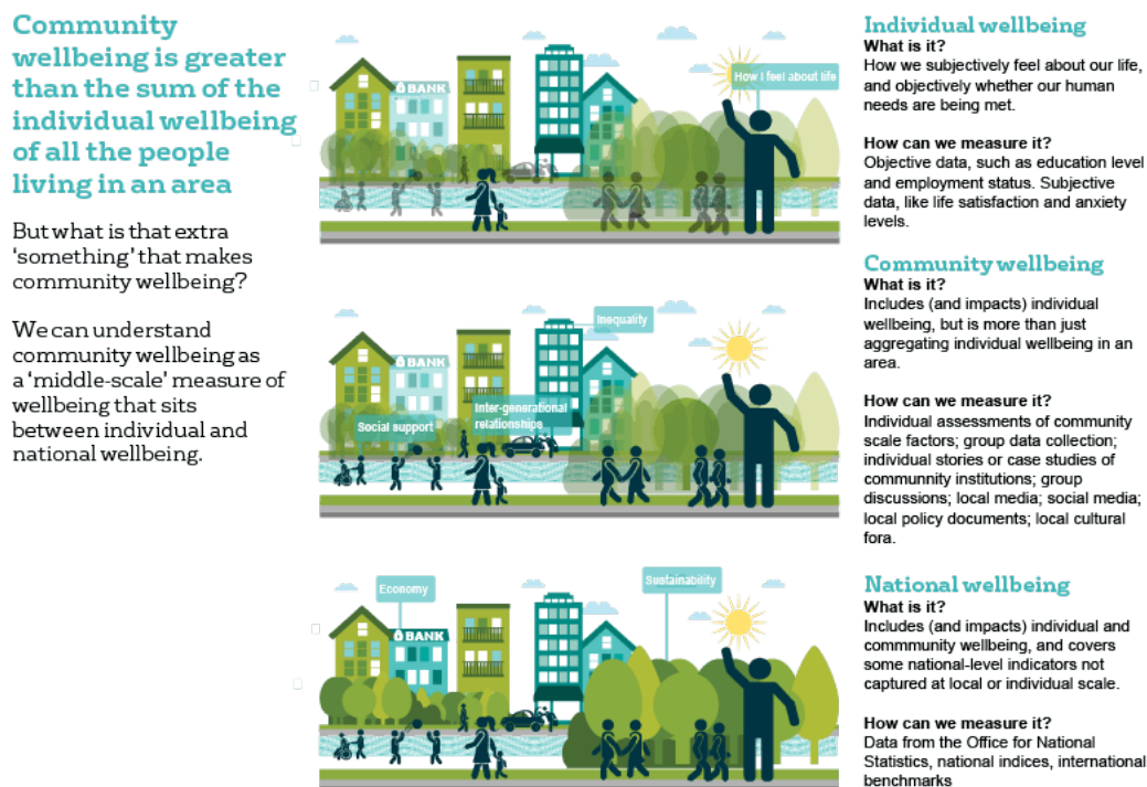
Figure 1: Concept of community wellbeing (from Atkinson et al. 2017)

https://www.whatworkswellbeing.org/blog/what-is-community-wellbeing/?mc_cid=53cf82ad99&mc_eid=fa077fdc1f )