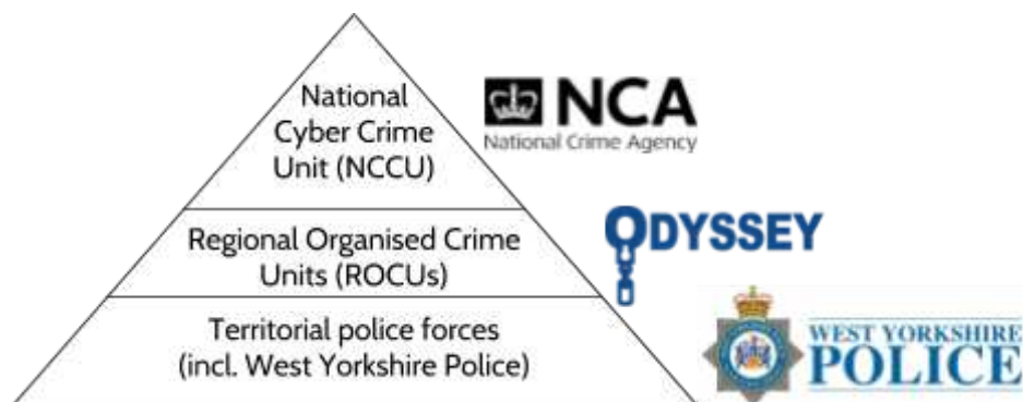
Figure 1 Structure of cybercrime units in UK

The Regional Organised Crime Units are sub-units of the NCCU and they provide specialised services on a regional basis. There are 9 ROCUs in the England and Odyssey is the ROCU for the four forces of Yorkshire and the Humber. The ROCU network has been considered best practice internationally and has been adopted by law enforcement agencies in other countries (Cabinet Office, 2016). Odyssey provides specialist services such as cyber investigation, digital forensic examination, financial investigation and specialist intelligence resources as well as helping to tackle serious drug trafficking and firearms offenses across force boundaries.