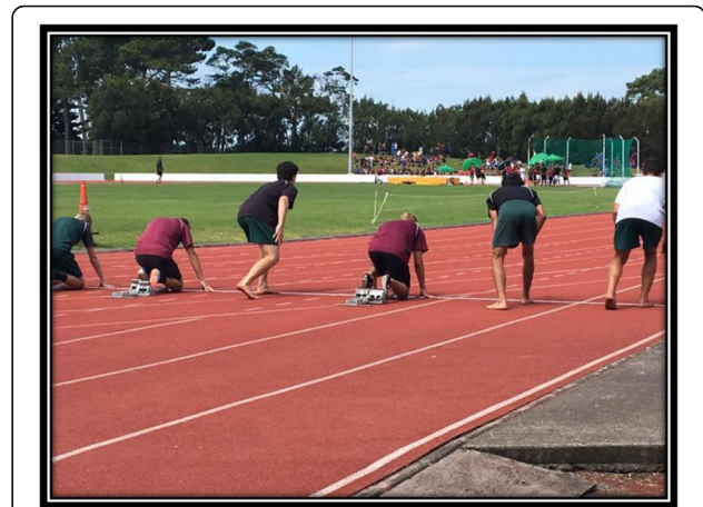
Fig. 1 The start of the 100 m in a secondary school boy's athletics event in Auckland, New Zealand, March 2017

Footwear, particularly that used in repetitive athletic activities, represents an economic cost to communities and is often purchased in the interest of maintaining musculoskeletal health or injury prevention. However, in running at least, the evidence to support the prescription of specific shoe types, with the aim of injury prevention, is inconclusive. [12, 13] Given that the health implications of differences in foot morphology and running kinematics because of growing up shod are unknown, it raises the question should children and adolescents be advised to always wear shoes in circumstances where there is little threat to foot perforation or extreme temperatures? New Zealand is an industrialised country with comparative resources to American and European countries used to study shod populations. However, it appears to be culturally apparent and socially acceptable to conduct activities barefoot. The authors of this paper observed secondary school students (Fig. 1), from an area of high-socioeconomic status,