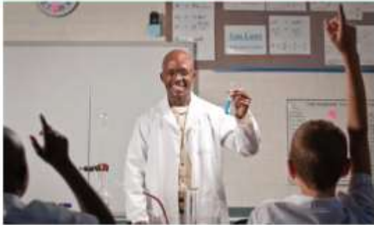
Classroom-based training and paid placements offer new routes to qualified teacher status.

A postgraduate certificate of education (PGCE) from a university department of education has long been the preferred route into teaching.