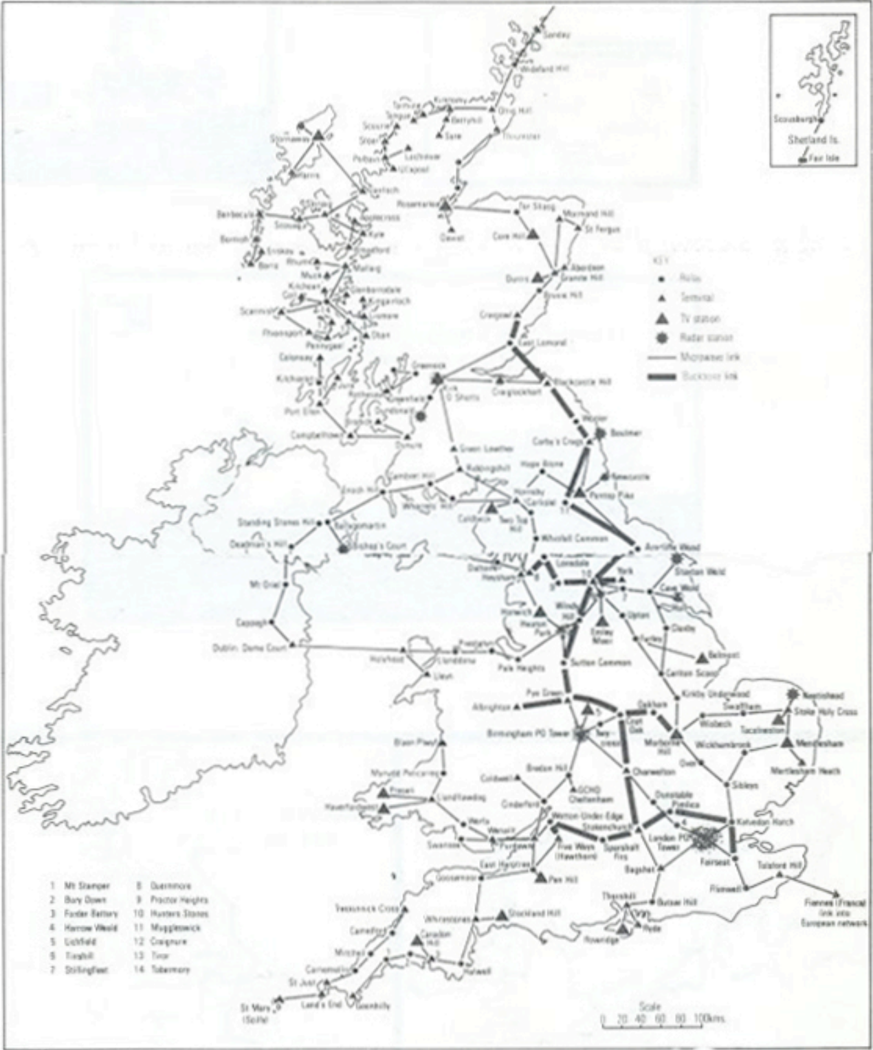
Figure 1: UK Phone Tap System

easier said than done - although the first steps, in this case, are relatively simple.