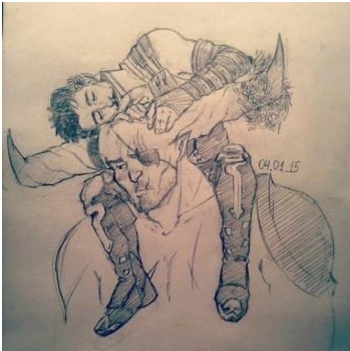
Picture 5. Adoribull 2, by Itachaaan, Tumblr blog, Public Domain (click to expand).