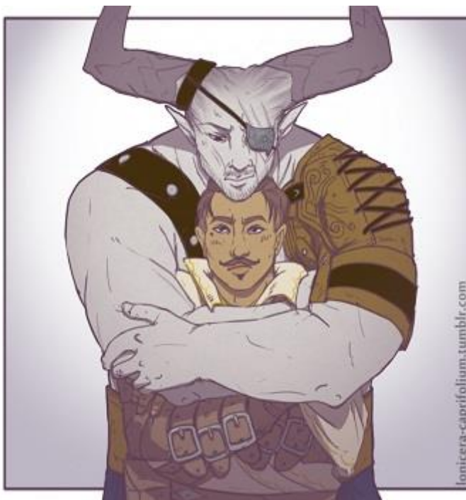
Picture 7. Adoribull 3, by Ionicera-caprifolium, Tumblr blog, Public Domain (click to expand).