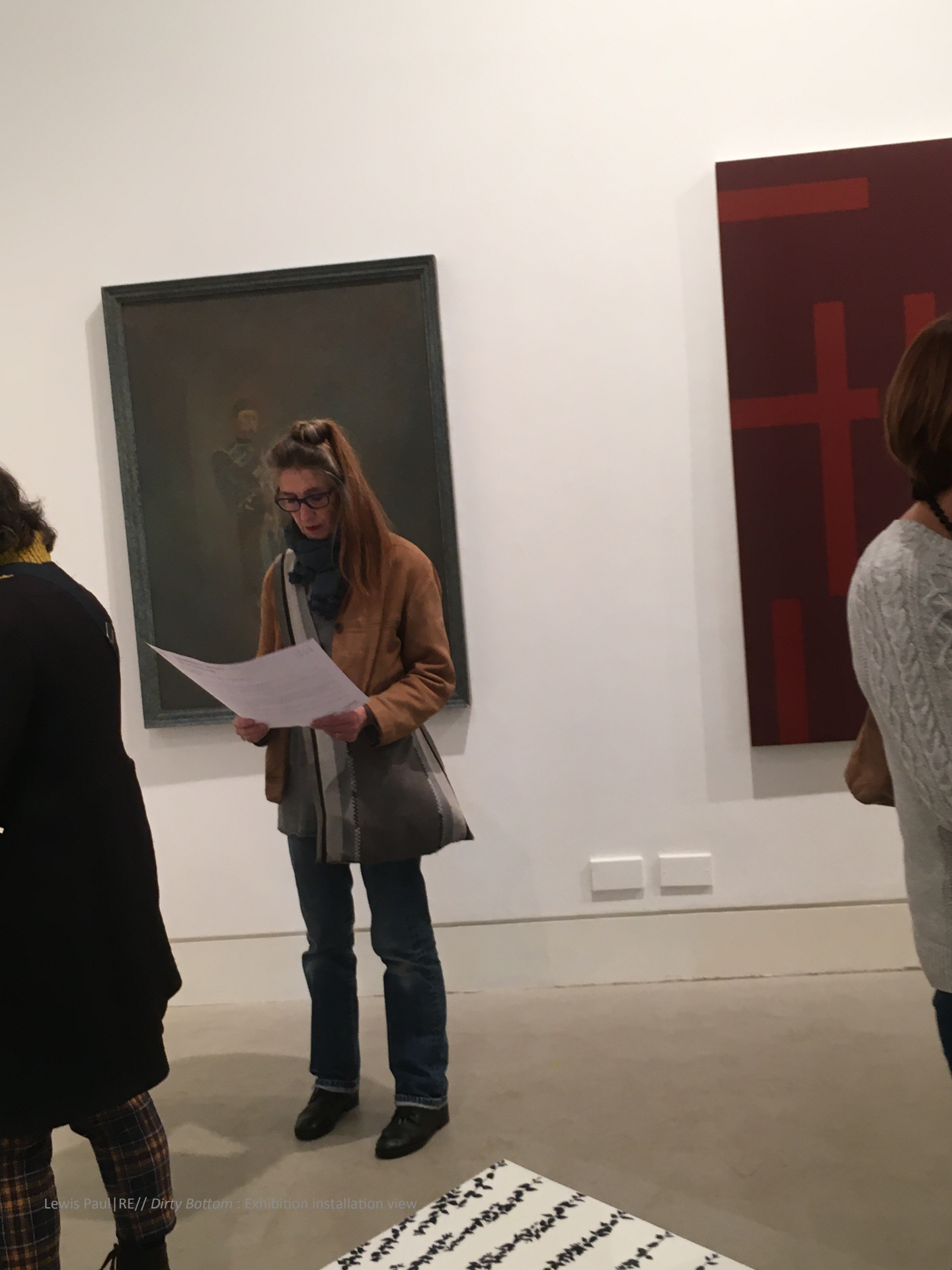
Lewis Paul | RE// Dirty Bottom : Exhibition installation view