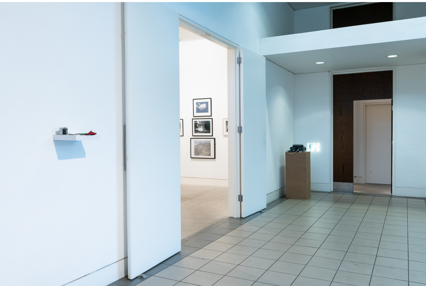
Lewis Paul | RE// Dirty Bottom : Exhibition installation view