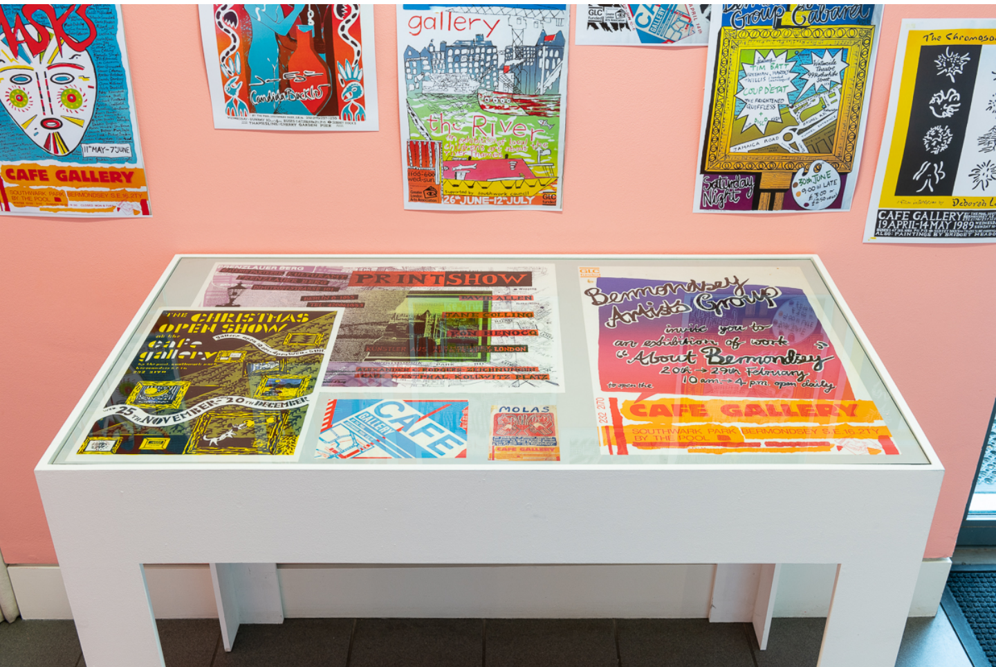
Lewis Paul | RE// Dirty Bottom : Exhibition installation view