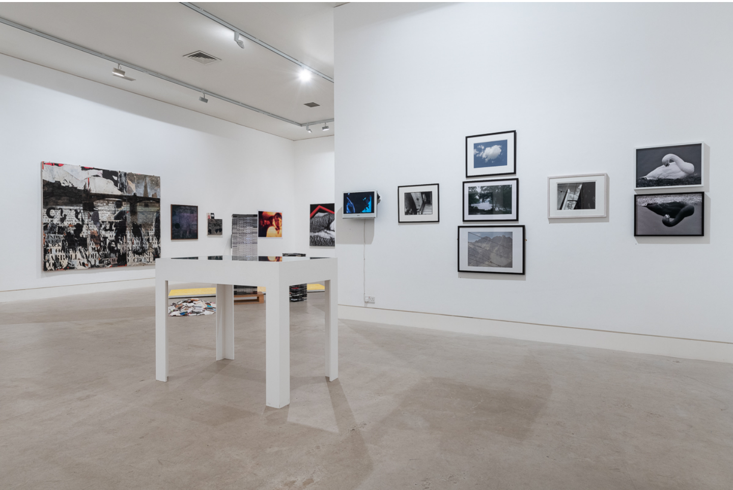
Lewis Paul | RE// Dirty Bottom : Exhibition installation view