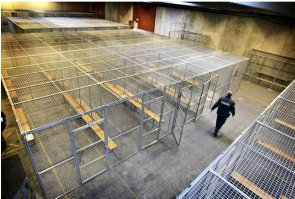
Figure 1: temporary prison, http://multimedia.pol.dk/archive/00399/Modtagecenter_399502y.jpg

practice in Denmark, and taken to the cages of the temporary prison in Valby where only a handful faced charges. A number of people reportedly witnessed the preventative arrest of an individual on the premise that he was standing near a brick which he may throw in the future. Whilst there had been previous arrests at the unsuccessful ‘Don’t Buy the Lie’ action the day prior, the scale of arrests on the 12th was unprecedented not only at the COP but in Danish history.