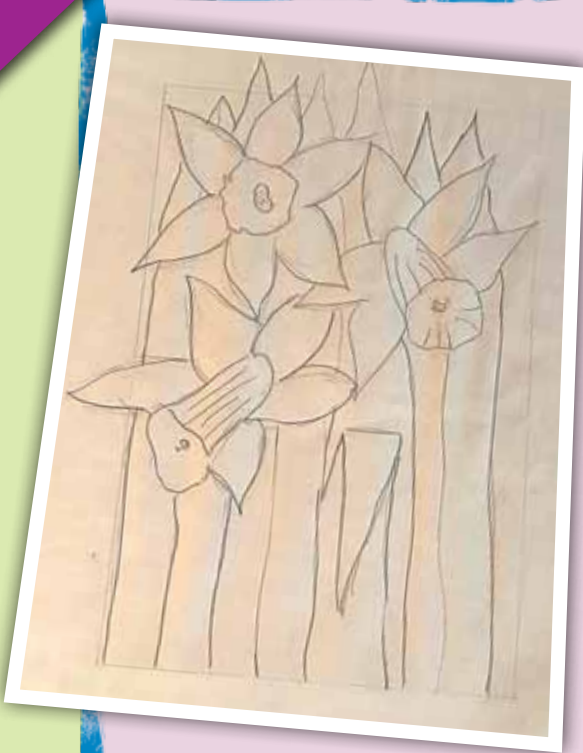
A pencil sketch of daffodils and the finished silk painting

Painting flowers on silk is a delightful way for children to combine making detailed observations of flowering plants with learning about and practising the ancient art of silk painting.