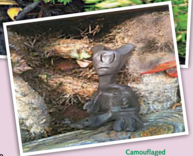
Camouflaged creatures in their preferred habitats