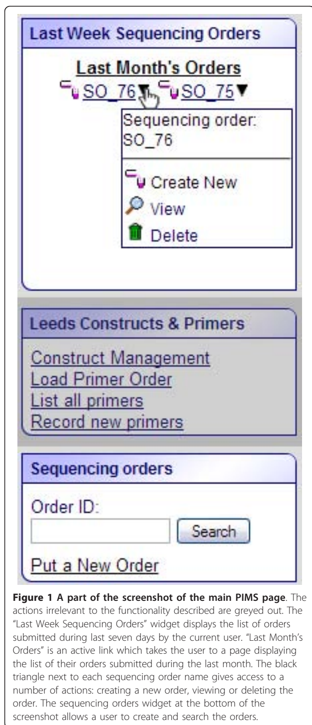
Figure 1 A part of the screenshot of the main PIMS page. The actions irrelevant to the functionality described are greyed out. The "Last Week Sequencing Orders" widget displays the list of orders submitted during last seven days by the current user. "Last Month's Orders" is an active link which takes the user to a page displaying the list of their orders submitted during the last month. The black triangle next to each sequencing order name gives access to a number of actions: creating a new order, viewing or deleting the order. The sequencing orders widget at the bottom of the screenshot allows a user to create and search the orders.

One of the frequent irritations of large computer systems is the difficulty of locating the desired information. Accordingly, the PIMS sequencing extension is designed to display only the information relevant to the user. For example, when the user logs into PIMS, the main page displays the orders recently submitted by this user. Older orders or orders which do not belong to the user