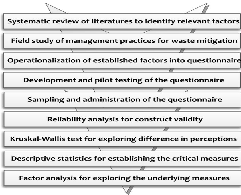
Figure 1: Methodological flow chart for the study