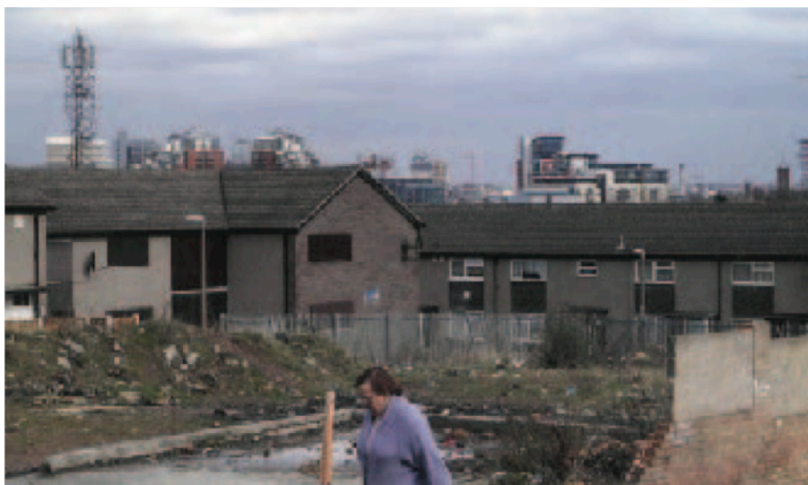
Figure 1. New Wortley, Leeds (Irena Bauman)

New Wortley, an inner-city suburb of southwest Leeds is the city's most impoverished with 34% of people claiming out of work benefits. Rows of red brick back-to-back terrace housing were collapsed into their basement in the 1960's slum clearance. In their place, a Radburn design estate of poor quality semi-detached and adjacent high-rise dwellings were erected. The traditional high street has been slowly eroded by legislative moves and piecemeal demolition. Today New Wortley has little urban quality or identity to be proud of or relate to, it is a harsh and disconnected physical environment. This is matched by the social situation where the needle exchange at the pharmacy next door to New Wortley Community Centre (NWCC) is the most heavily used in Leeds. Coupled with the highest suicide rate in the city, New Wortley has an average life expectancy of just fifty years of age.