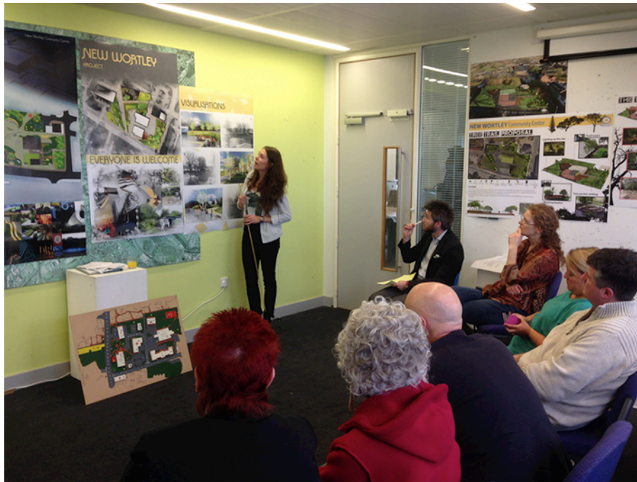
Figure 10. Landscape design presentation

When considering finances, the café has not performed as successfully as other aspects of NWCA's business model, probably due to an architectural error in the co-design process. For security, the new community centre building has one entrance requiring all guests to sign in, from here one may transition into the café. Passing footfall wishing to purchase a coffee are unlikely to undertake the process, thus the café should have been separately accessed. With redevelopment of the existing building a potential future phase, this is an element to address.