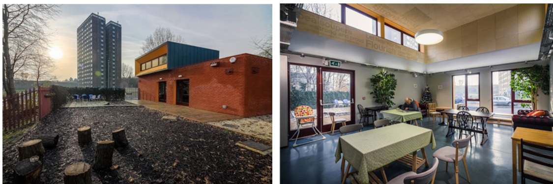
Figure 11. New Wortley Community Centre

The final lesson to be learnt sees NWCA a victim of their own success. In the range of services now offered a number have become so popular advance booking is required, potentially alienating the very people they are designed to serve. The prisoner greeting scheme has outgrown the space available entirely, requiring NWCA to now hire additional offices. Whilst to be celebrated in one regard, these issues raise serious questions relating to the actual possibility of achieving what NWCA aspire to – reaching everyone within the Community of Place. Thus, whilst the existing building will receive a facelift and a small increase in space in autumn 2017, funding is now being sought to at least double the current footprint. The continued influence of NWCA, and impact on the liveable future of the Community of Place, requires it to be found.