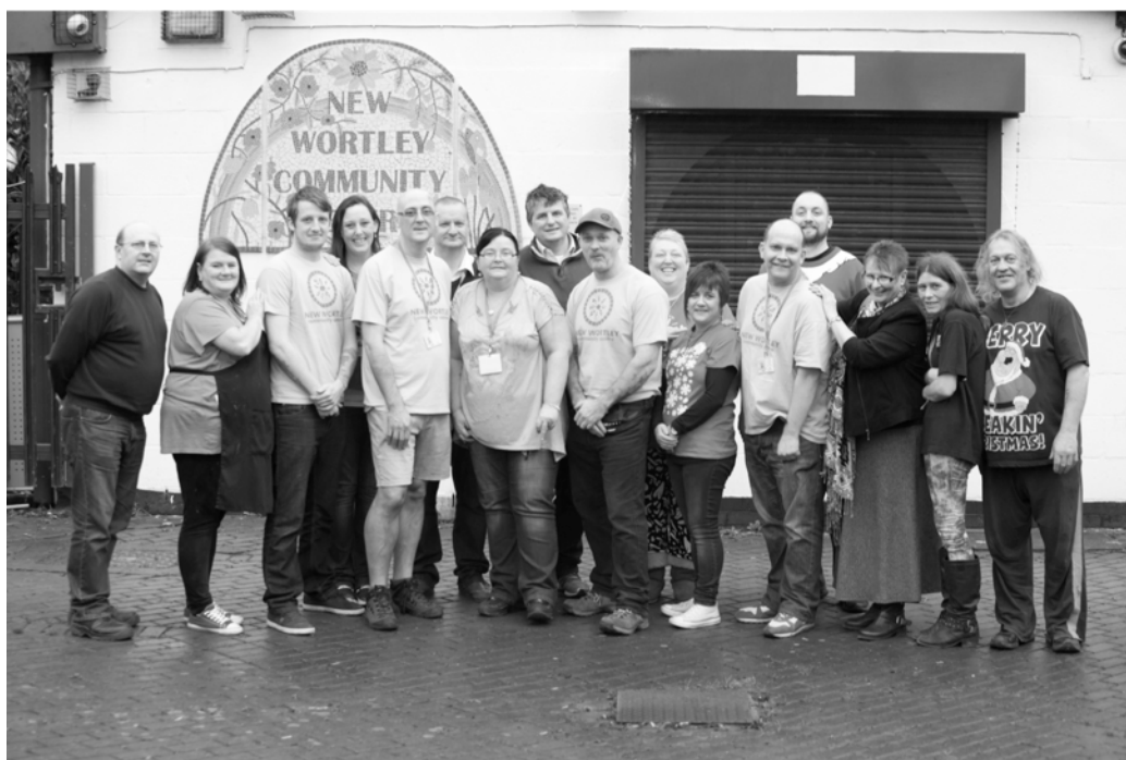
Figure 3. NWCA

The NWCA volunteers are called Team New Wortley; it is a diverse assembly with varying intentions and agendas, unified in their requirement for stability and a purpose enabling them to move forward. Some individuals have learning difficulties and thus see NWCA as a long-term supporter providing a safe and secure environment outside of their own home. Others are recovering from illness or addiction and use NWCA as a springboard to obtaining employment, some are retired and stave social isolation by integration. A growing number have full time employment but care so deeply about their Community of Place's continued improvement they offer their free time willingly. Thus, at the core of this liveable urbanity sits an enclave which shelters, feeds, upskills, and ultimately empowers its members to the benefit of the Community of Place. This is the crux, exemplified by the social impact statistics.