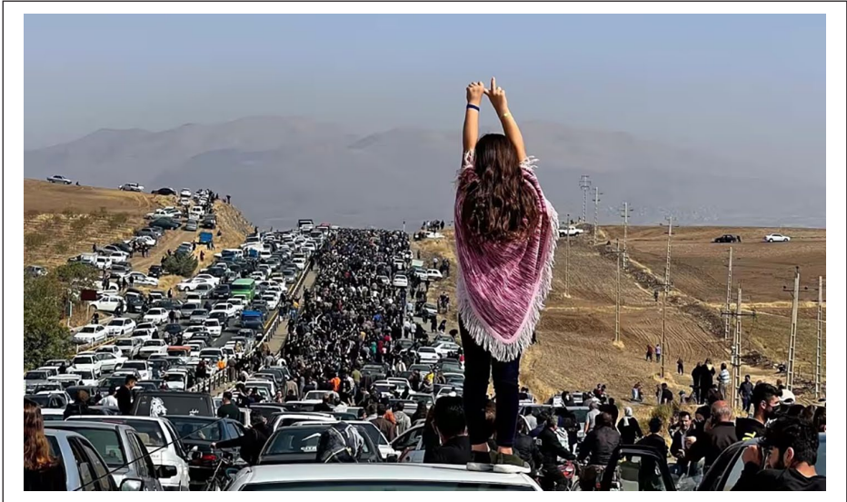
Figure 5. Protesters marching to the gravesite of Jina Mahsa Amini on her chehellom – the 40th day after her death.