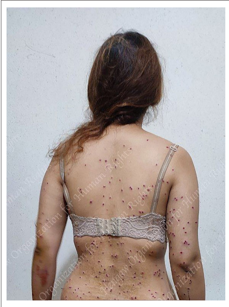
Figure 2. The marks of Birdshot – a type of shotgun pellet – bullets on the body of a female protester in Saqqez, Iran.