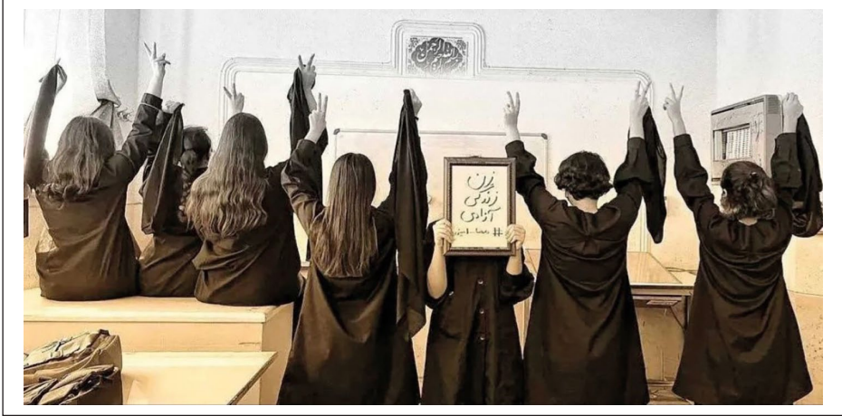
Figure 4. A group of Iranian schoolgirls protest in the classroom while removing their compulsory hijab. Covering her face, one holds a sign which reads: Zan, Zendegi, Azadi [Woman, Life, Freedom].

to transform the religious ceremonies and practices of mourning into political performance and activism. They amplified their children's favourite songs on their graves; sang lullabies that reflected women's resistance; danced, clapped and ululated collectively; and turned every chellom (the 40th day of the death vigil) into an act of political protest, as they were joined by a wider community. By engaging with people's emotions, these parents challenged the hegemonic ideas and framings in society, enabling the construction of group commitment and solidarity, and developing oppositional power from below (Routledge, 2017). By refusing to stay silent, invisible and unmarked, protesters performed visible acts of resistance that cut through the status quo and stood against years of oppression and religious fundamentalism (Figure 5).