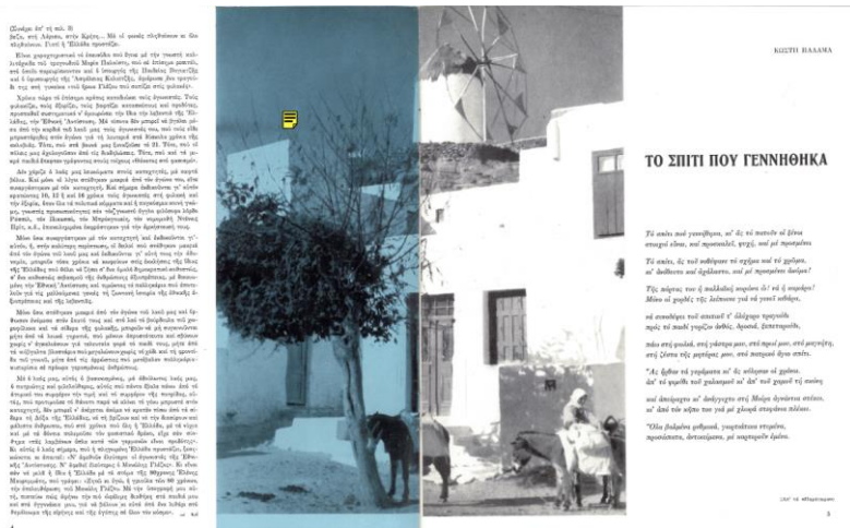
Figure 3. Pages 4-5 in Pyrsos , Issue 1, 1961. Poem by Kostis Palamas, reproduced by permission of the Secretariat of Kostis Palamas Foundation.

The representations of the Aegean landscape published in Pyrsos were also reflective of nostalgia, a sentiment that was as much constructed by the magazine as desired by its readers. Beyond their serenity and their 'particularly' Greek nature (warmth and sunlight), their culture (architecture) and their traditional (albeit underdeveloped) representations, these images brought to mind Greece's past, reflected its contemporaneous present, and imagined its future. The women who worked on their embroidery, protected from the sun under the balcony, in the previous analysis, and the old woman who loads a sack onto the back of a donkey against a typically Aegean landscape in Figure 2 are affirmations of such concurrent temporalities. It can be argued that these ambiguous representations invited contemplation and excited the imagination of Pyrsos ' readers as well as constructed their desire to be transported there, to take their place in the landscape. In one such example, the caption underneath a photograph of two older women washing a pile of rugs in the sea, shifts the attention from the depiction of backwardness and fixes the meaning of the image to that of nostalgia for the future. It asks, 'Is this our mother washing the rugs while