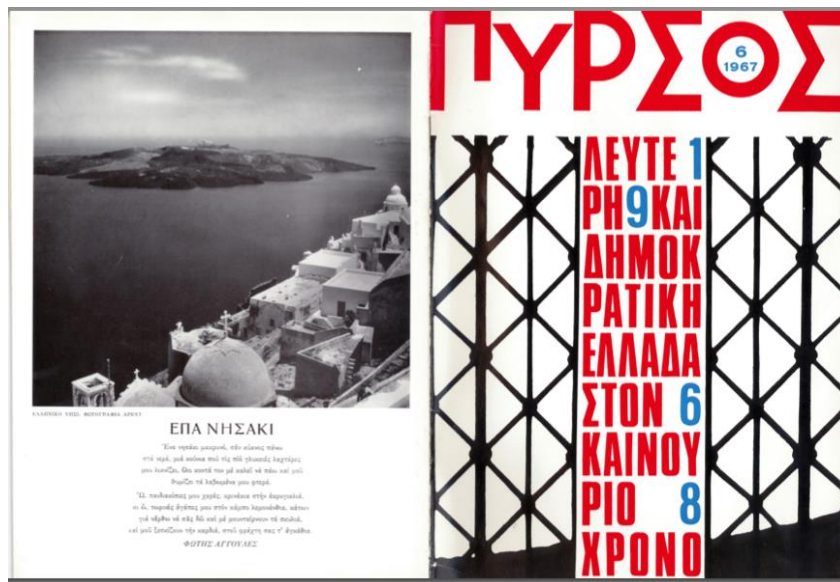
Figure 4. Front and back covers of Pirsos , Issue 6, 1967. Poem by Fotis Aggoules, reproduced by permission of Triantafyllos Mylonas.

Pirsos does not shy away from depicting the other Aegean; that is, a site of exile islands and political prisoners. From its launch until the end of its circulation in 1968, the magazine fiercely accused the Greek state of injustices inflicted upon those that fought for the 'country's independence', during the 'National Resistance'. Pirsos published reports from the exile islands as well as prisoners' memoirs, poetry and artworks. It called for amnesty, launched petitions addressing the Greek diaspora within and outside the socialist states and urged the international community to support its demands, especially following the establishment of the Colonels' dictatorship in 1967. As Voglis writes, 'Since the second half of the 1940s, the Greek state had subscribed to the theory "of the permanent civil war" in which the country had become 'an archipelago of punishment', with only a short 'liberal intermission' between 1964 and 1965, before returning to a 'new campaign of terror, arrests, prosecution, torture and imprisonment of its leftist political opponents' (2002: 224). During these years, hundreds of thousands of 'political subjects' 'were deported and tortured' on exile islands in the Aegean before either signing a loyalty certificate 'or dying'