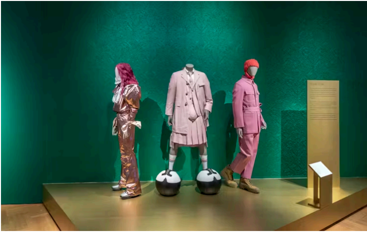
Three hot pink looks from the exhibition by Harris Reed, Thom Browne and PRONOUNCE. Fashioning Masculinities, V&A.

In 1930, the Freudian psychoanalyst John Carl Flügel argued that a reversal of this pattern could be identified at the end of the 18th century. In what he called the “great male renunciation”, men’s fashion became austere and decoration the sole preserve of womenswear. This change is related to the rise of desk-based professions and their associated uniforms following the industrial revolution.