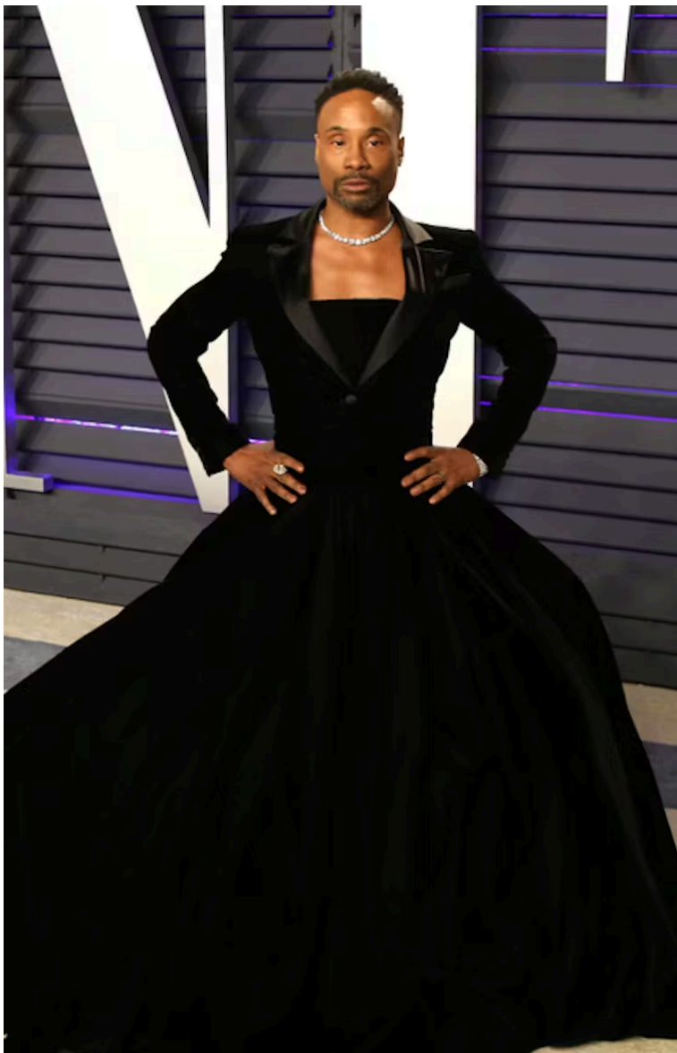
Billy Porter in his black tuxedo dress at the 2019 Oscars.

Harry Styles is demonstrably not the pioneer of man-dresses. However, his gender-fluidity does reissue an important symbolic challenge to what sociologists call “normative man”. This is especially significant, given that this shoot would see Styles become Vogue ’s first male solo cover star.