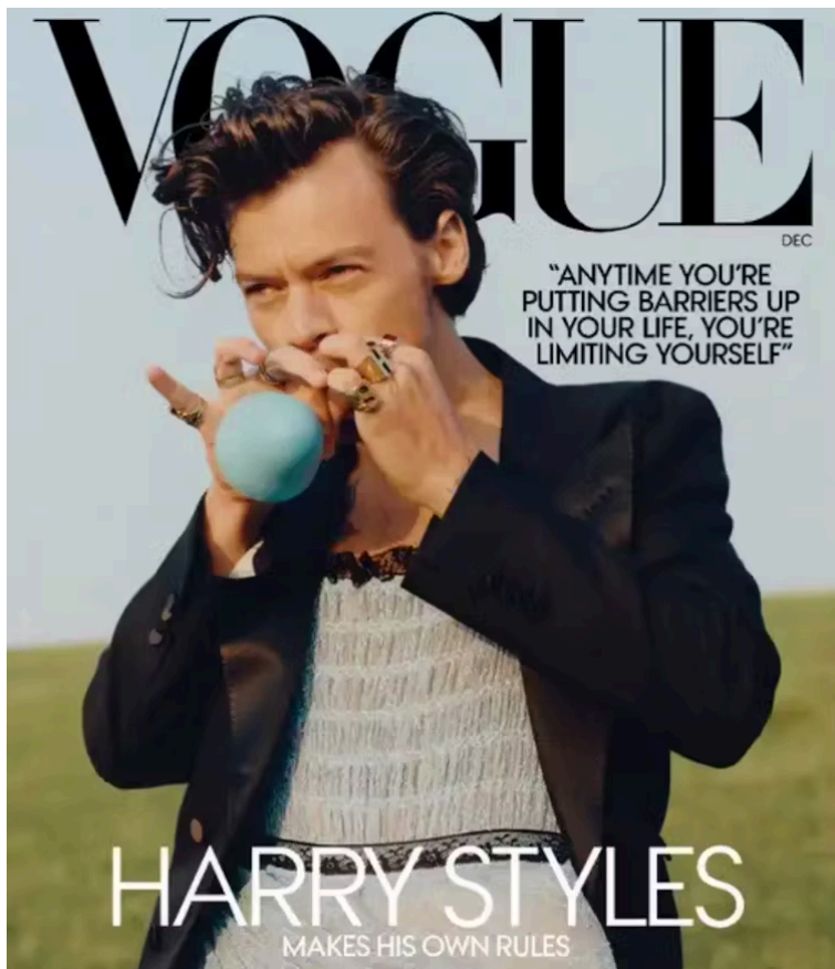
Former One Direction singer Harry Styles wearing a dress on the cover of Vogue.

Styles is directly confronting socially dominant ideas of what it is to be a man. A new exhibition at London's V&A museum called Fashioning Masculinities places Styles' Gucci dress right at its centre. It teaches us that sartorial transgressions like these have a rich and complex history and suggests that men's fashion has always been at the heart of the politics of gender.