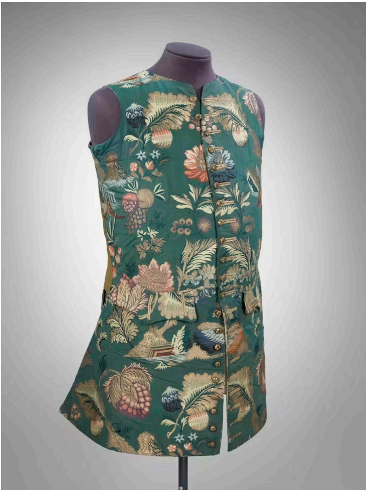
A brocaded silk waistcoat from 1730. Fashioning Masculinities, V&A