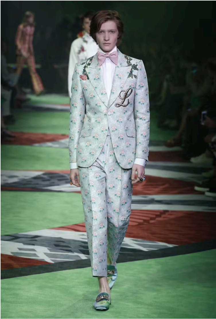
Gucci spring/summer 2017. Fashioning Masculinities, V&A

Styles' gesture represents a significant redefinition of masculinity that must be considered transgressive. Yet, as Porter recognises, it also has the unfortunate consequence of disguising the political persecution of sexual and racial minorities behind aesthetic questions of play and performance.