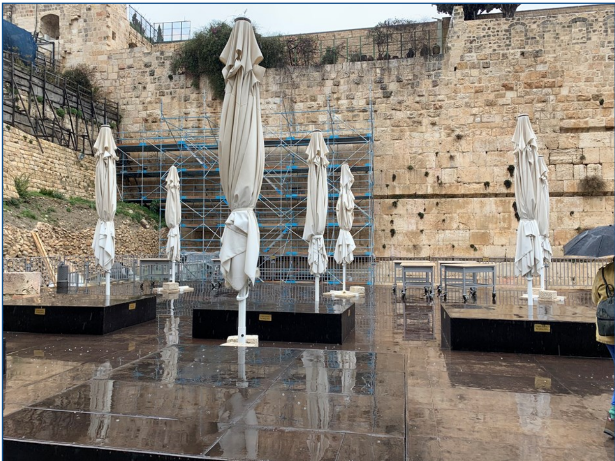
Figure 5: Commercial event space adjacent to the Western Wall, Jerusalem, Israel.

Jerusalem and the Holy Land are not without such event activities. A short walk from the holiest Jewish site in Jerusalem, the Western Wall, is an outdoor event space that is available for commercial hire. It is