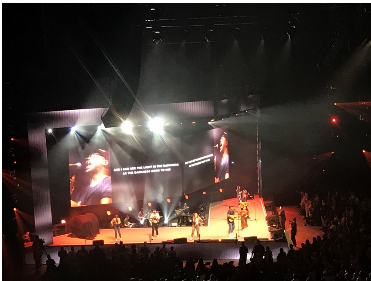
Figure 4: Cherish Conference, First Direct Arena, Leeds, UK

In interviews with the exhibition organisers it became evident that there were experiences of the numinous by staff. Such experiences have been studied elsewhere; according to research by Cameron and Gatewood, museum visitors often experienced the transcendent, or found themselves in 'spiritual communion' (2003:67) with historical and religious objects. Latham (2013) also discovered museum visitors who reported similar encounters.