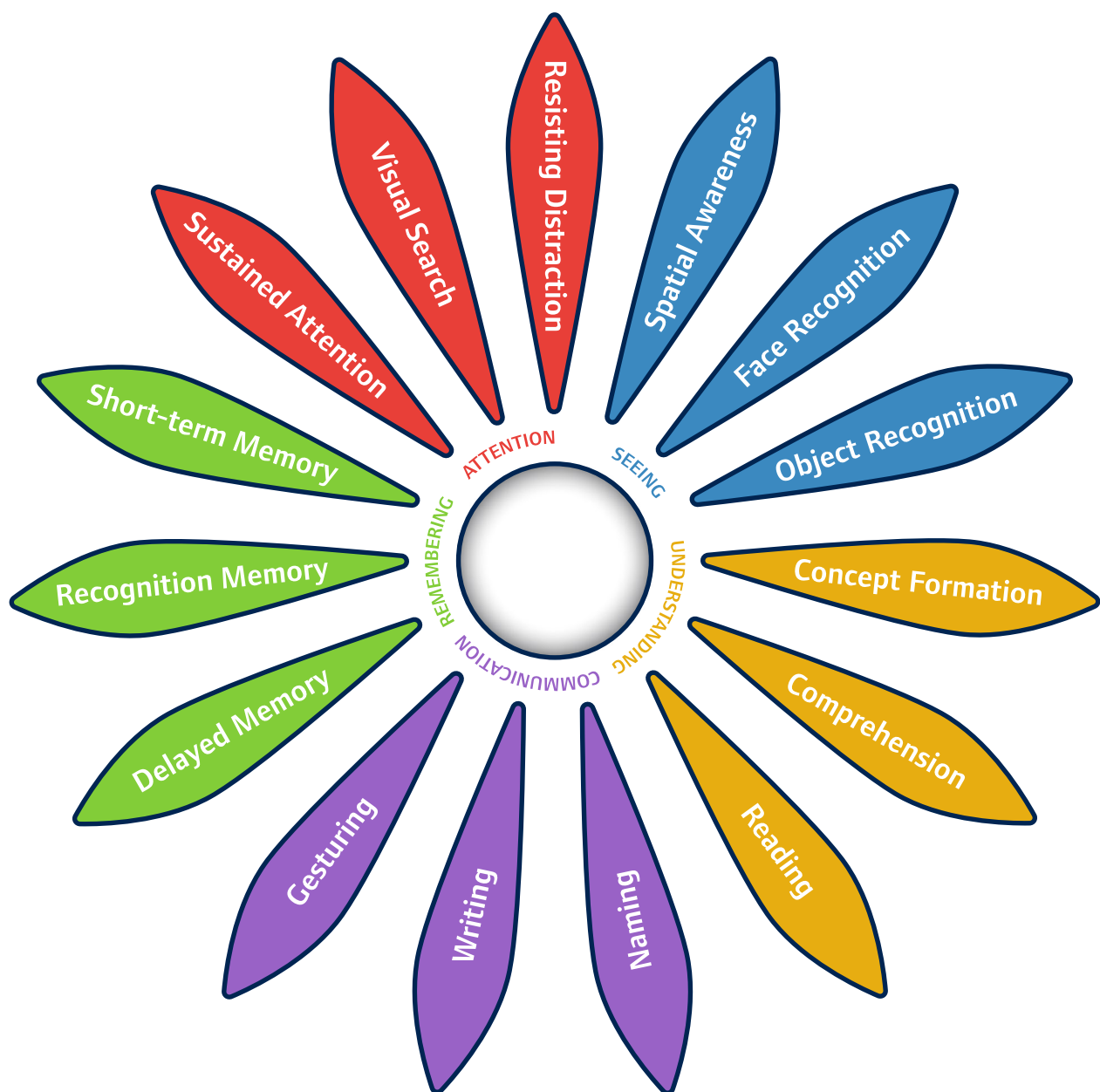
Fig. 1 The Cognitive Daisy

introduction of COG-D increased staff ratings of their own understanding of residents' cognitive problems, and that staff perceived the Cognitive Daisies as highly useful for delivery of person-centred care [20].