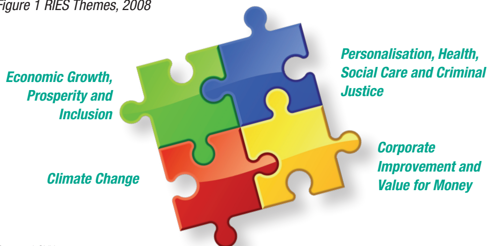
Figure 1 RIES Themes, 2008