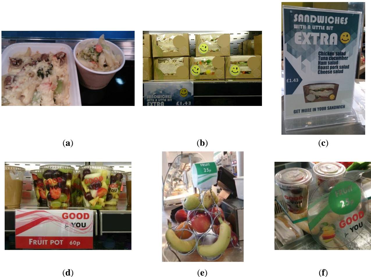
Figure 1. Some of the nudge strategies implemented for designated food items during the intervention: (a) disposable pots for freshly prepared vegetarian daily specials; (b) stickers on sandwiches containing salad; (c) poster promoting sandwiches containing salad; (d) stickers and end of shelf labels for fruit pots; (e) pyramid display stand holding whole fruit; and (f) window sticker promoting whole fruit.