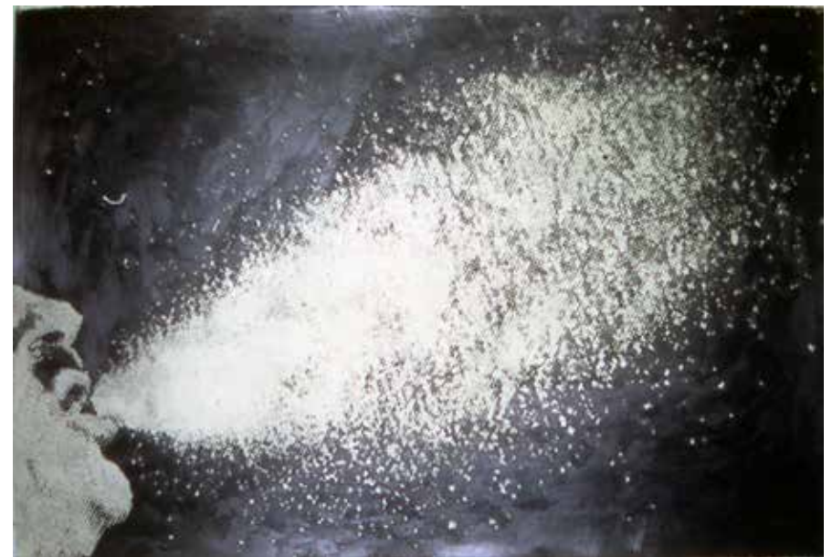
Above: Blast , 1997-1998, Graphite on Paper, 22" x 30"