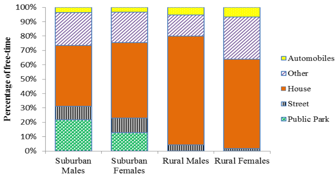
Figure 3. Percentage of free-time that suburban and rural youth spend in different environments on average during weekdays.

In terms of time spent in an automobile, there was no significant difference in the PA levels of rural and suburban youth ( p > 0.05 ). However, a univariate ANOVA did reveal that for youth who travelled by automobile during the weekend, females spent significantly more time in automobile transport compared to males ( F_{(1,17)} = 5.595 , p = 0.033 ), regardless of geographical location. The same significant difference was also apparent when comparing percentage of weekend free-time spent in a car or bus between genders ( F_{(1,17)} = 6.605 , p = 0.022 ). Whilst a similar percentage of males and females utilised automobile transport during the weekend (73% and 67%, respectively), females on average spent 44.28 minutes in an automobile being transported compared to males spending just 19.34 minutes. Weekday differences in the proportion of free-time that youth spend in different environments such as the street, park and indoors are illustrated in Figure 3.