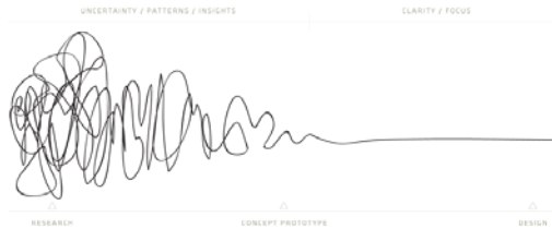
Figure 1: The Process Design Squiggle by Damien Newman

The first step in the process is to build empathy and the designers are directed to begin by setting aside pre-conceptions and knowledge of existing solutions. Damien Newman's squiggle illustration [9] captures this mindset and in particular the almost chaotic early stages of a Design Thinking approach: