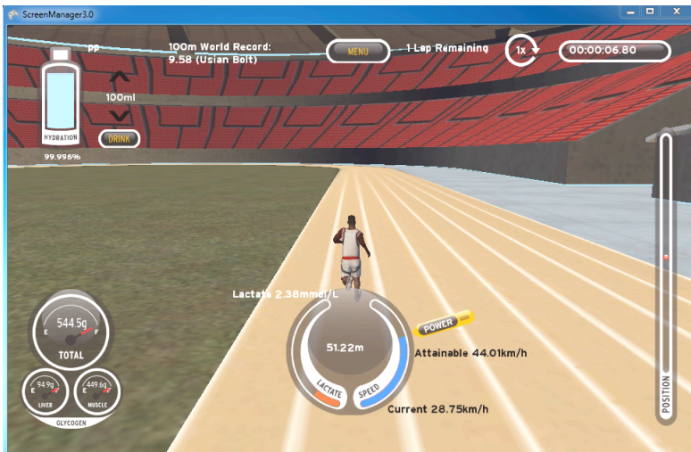
Fig. 2. The main 3D running view of the game. The central widget shows lactate level and speed, and the yellow lever on the centre-right side can be moved with the mouse to control the runner's speed.