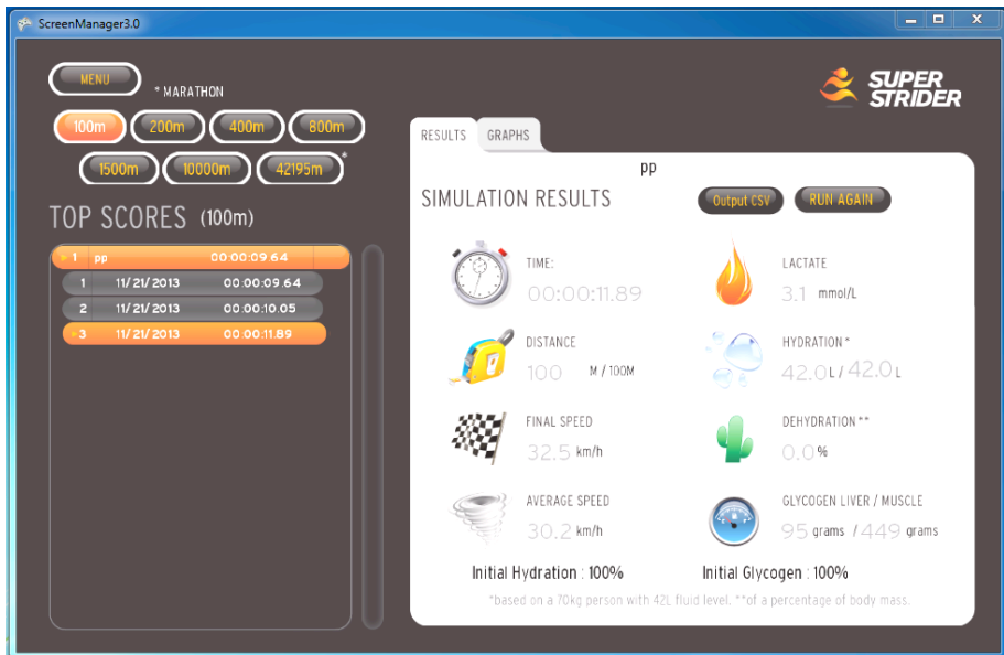
Fig. 3. Results after a completed run. The table shows levels and running data (right). Also the top scores for the specific running distance are shown (left).

After the run has been completed, the screen shows the final state of the simulation with the levels of lactate, glycogen and hydration. In addition, the running time is shown as well as average speed and final speed (Fig. 3). The user then can see graphical plots of these data over time or distance (Fig. 4).