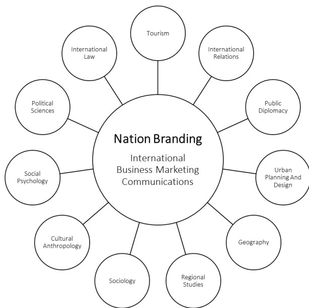
Figure 2: Disciplines related to place (nation) branding

The various disciplines related to place/nation brand and place branding are shown in Figure 2 below.