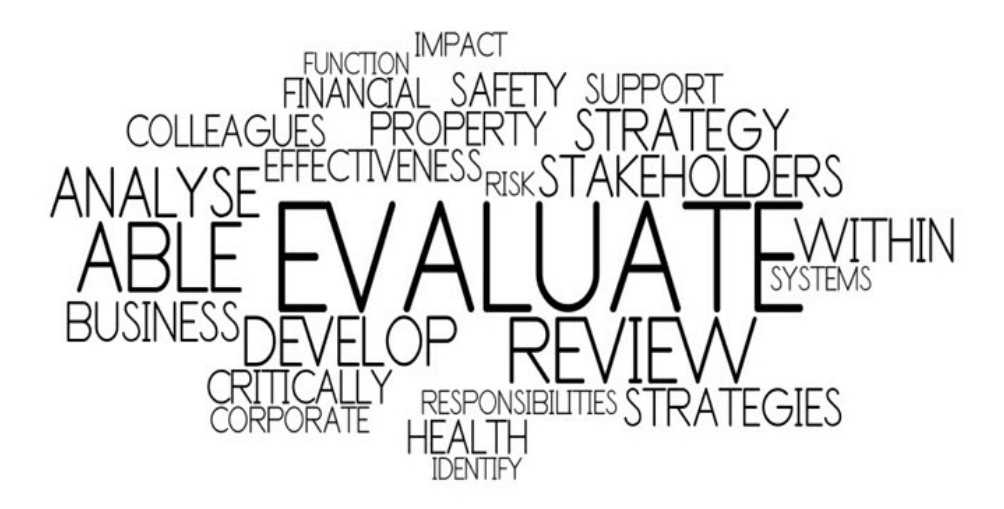
Figure 8Wordle analysis of BIFM Level 6 Diploma

The preponderance of the verbs analyse and evaluate corresponds to the higher level of the cognitive process according to Bloom's Taxonomy, as revised by Anderson and Krathwohl (Anderson & Krathwohl, 2001).