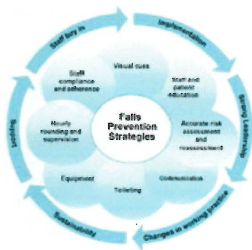
Figure 2: A Conceptual Framework to demonstrate the key factors and concepts required for a multi-strategy approach to in-patient falls prevention

Falls prevention requires staff motivation and momentum in order to embed these innovative strategies into working cultures. Other initiatives need to be pursued to confront this safety concern, so prevention and reduction of falls rates will, by default, improve the patient experience, quality of life and engender a multifaceted approach in the overall care of the elderly.