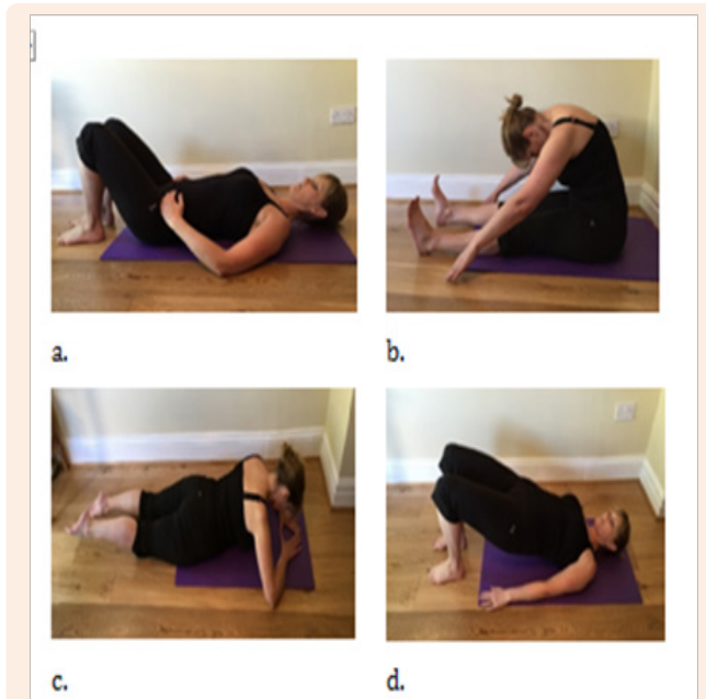
Figure 1: Pilates Intervention a. LSN, b. spine stretch forward, c. diamond press, d. shoulder bridge.

in LF, VAS, CE and ODQ after the 6-week Pilates intervention. Analyses of data were performed using the statistical software SPSS 22 for Windows (SPSS Inc, Chicago IL, USA). A statistical significance value of P < 0.05 was accepted.