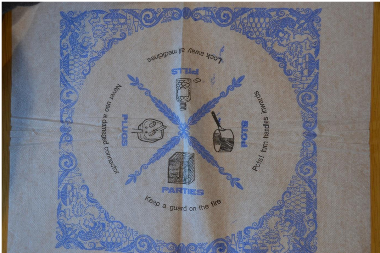
Fig. 3: RoSPA Leaflets Folder 2: General Home Safety, not dated.

But the question remains, why would RoSPA take the novel approach of printing and distributing these serviettes for use in its campaign literature?