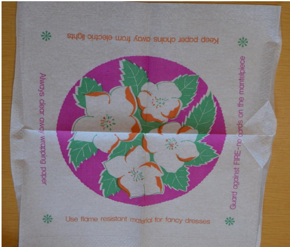
Fig. 1: RoSPA Home Safety Planning Guide No. 66, 1971-72.

The second serviette (fig. 2) used a mixture of 'humorous' cartoons and warnings against workplace accidents, all involving men performing manual tasks. For example, 'Why fall for this: keep a guard rail round all openings' accompanies an image of a man carrying a box who is about to fall into an unguarded manhole because he's too preoccupied leering at the woman walking past; an instance of casual sexism, but one suggested as potentially carrying a penalty. This serviette centred on trips and falls, rather than burns and scalds, which indicated that these were more common accidents facing 1970s male manual workers. Indeed, many of the workplace safety posters produced by RoSPA stressed the importance of taking care in order to avoid accidents. The serviette was a novel way to publicise this message in works canteens.