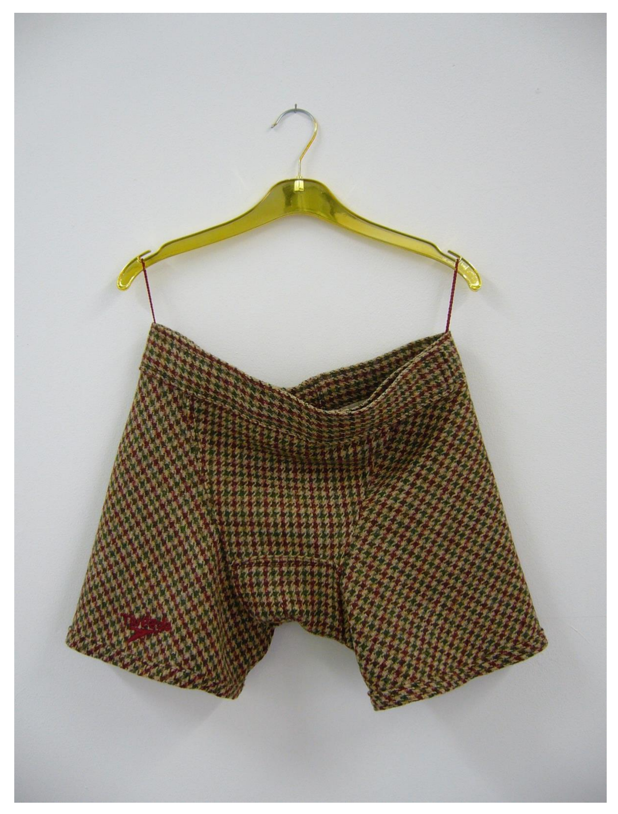
Pool (2015) Tweedo's, paul,L (2015) (exhibited work) image.