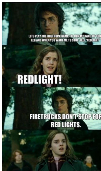
Figure 26 – Horny Harry

Another Horny Harry meme (Figure 26) shows an interaction between Harry Potter and Hermione Granger, where Harry suggests that he and Hermione play “the firetruck” game – he will run his hand up her leg, and when she feels uncomfortable and wants him to stop she can yell “redlight”. In the second frame Hermione calls redlight, yet Harry reminds her that “firetrucks don’t stop for red lights”.