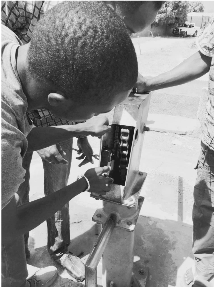
Fig 2. Installing a MANTIS unit in The Gambia

Operational data is conveyed from site, both on a routine basis and by exception to confirm inactivity and possible failure. This information can be processed locally with minimal power overhead. An operational battery life of greater than 5 years has been calculated based on the power consumption of the units. Succinct data packages are sent from the unit, via SMS messages and a SMS Gateway, in order to centralise information for access via an online user-interface (UI). The following example highlights the potential of this new technology.