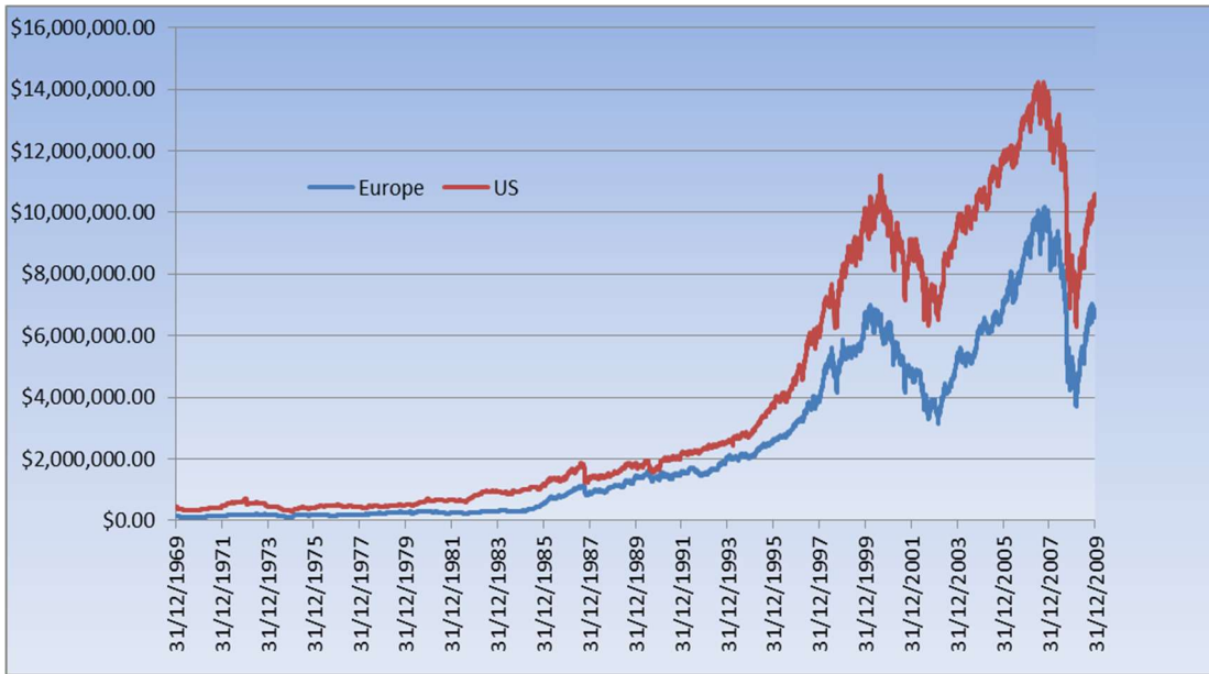
Figure 1. MSCI Indices Europe/US Market Capitalization (US$)