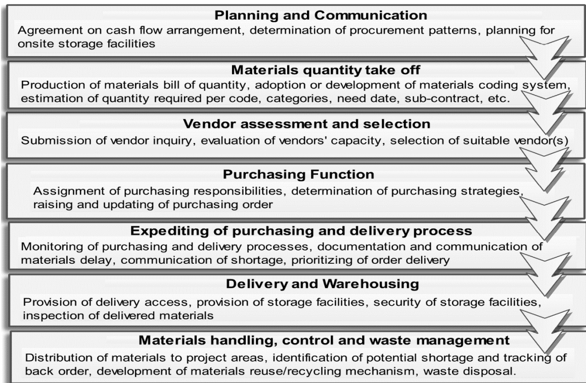
Figure 1: Key stages of materials logistics management in construction projects

usually involves a number of stages including materials take-off, bill of materials, warehousing and the actual use of the materials. At the early stage, an effort is required to ensure that the materials take-off is accurately made from project specification in order to prevent error in ordering (Bell and Stukhart, 1986). The increasing use of Computer Aided Design (CAD), and specifically the use of BIM tools for materials take-off, is continuously facilitating efficient estimation of materials required for building activities. Nonetheless, this largely depends on the accuracy of the drawing documents and adequate coordination of drawings between various professional parties involved in modern-day designs (Monteiro and Martins, 2014).