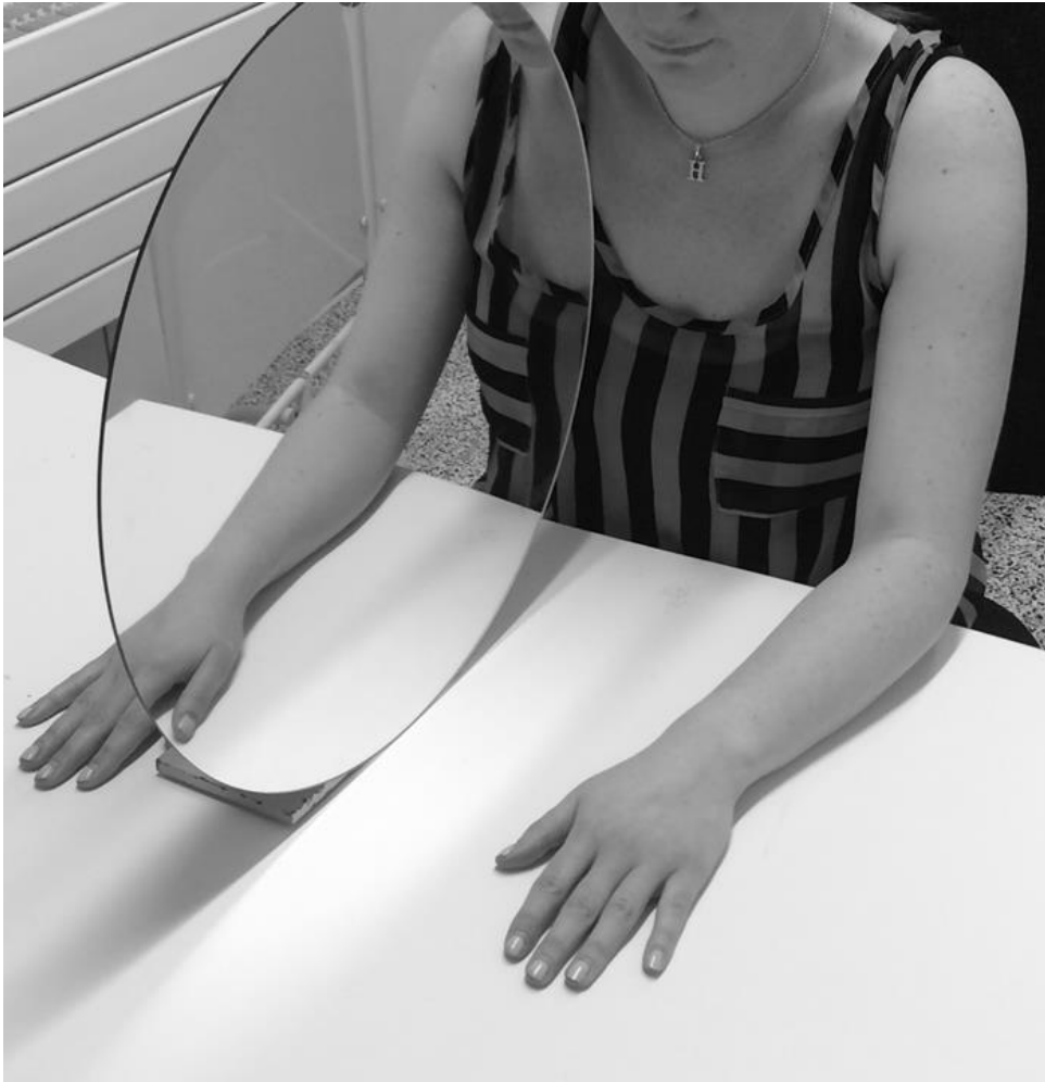
Figure 1 Positioning for upper limb mirror therapy