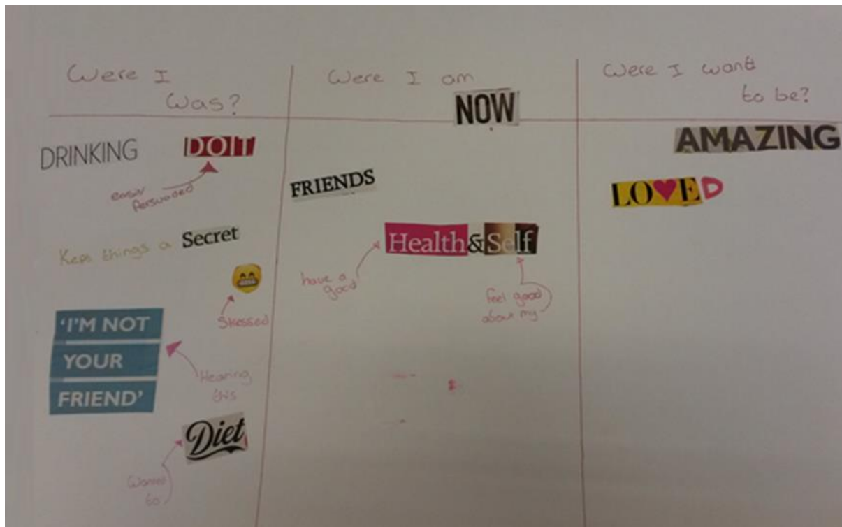
Figure 3: Jenna's Storyboard

'I was in a really horrible place, horrible school-life, self-harm, no-one to talk to, I had a, and still do horrible relationship with my mum. Now we're okay 'cause like not...things aren't great but plodding on. I'm stopping drinking. I've been drinking too much and I don't want to end up like my mum. My friends have told me to watch what I am drinking because my mum's been an alcoholic since before I was born...but it got to the point where I was just using it as a release of my problems and it's not healthy so I've decided to stop drinking for a bit until I get myself sorted. On my way to university which is where I want to be, I want to be in a stable home and I do want a decent relationship with my mum but now there is someone to talk to [Engagement Worker] which I've so...where I want to be is like got to already like university studying away, hopefully in London and just making new friends, getting independent so I could just go on forever 'cause that...path that I want to follow, yeah...'