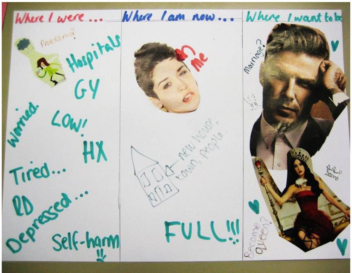
Figure 2: Cat's Storyboard