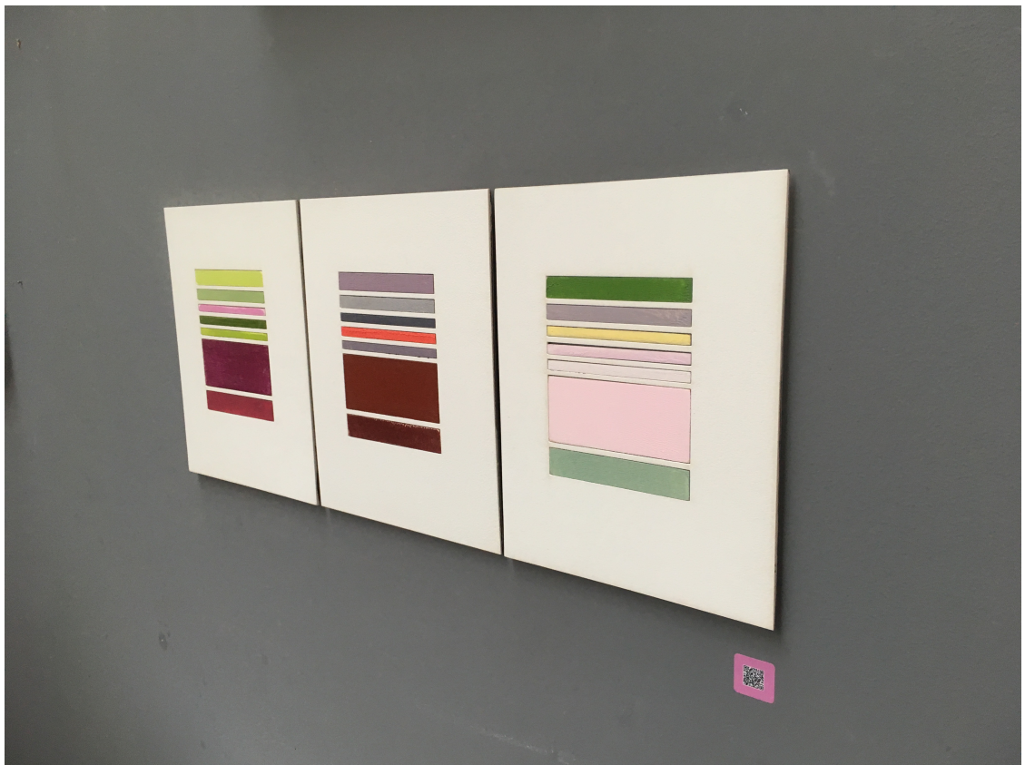
Paul, L, Taylor, S: Installation view Women's executive study (painting, mixed media), Little Pink Bush - Digital Film.