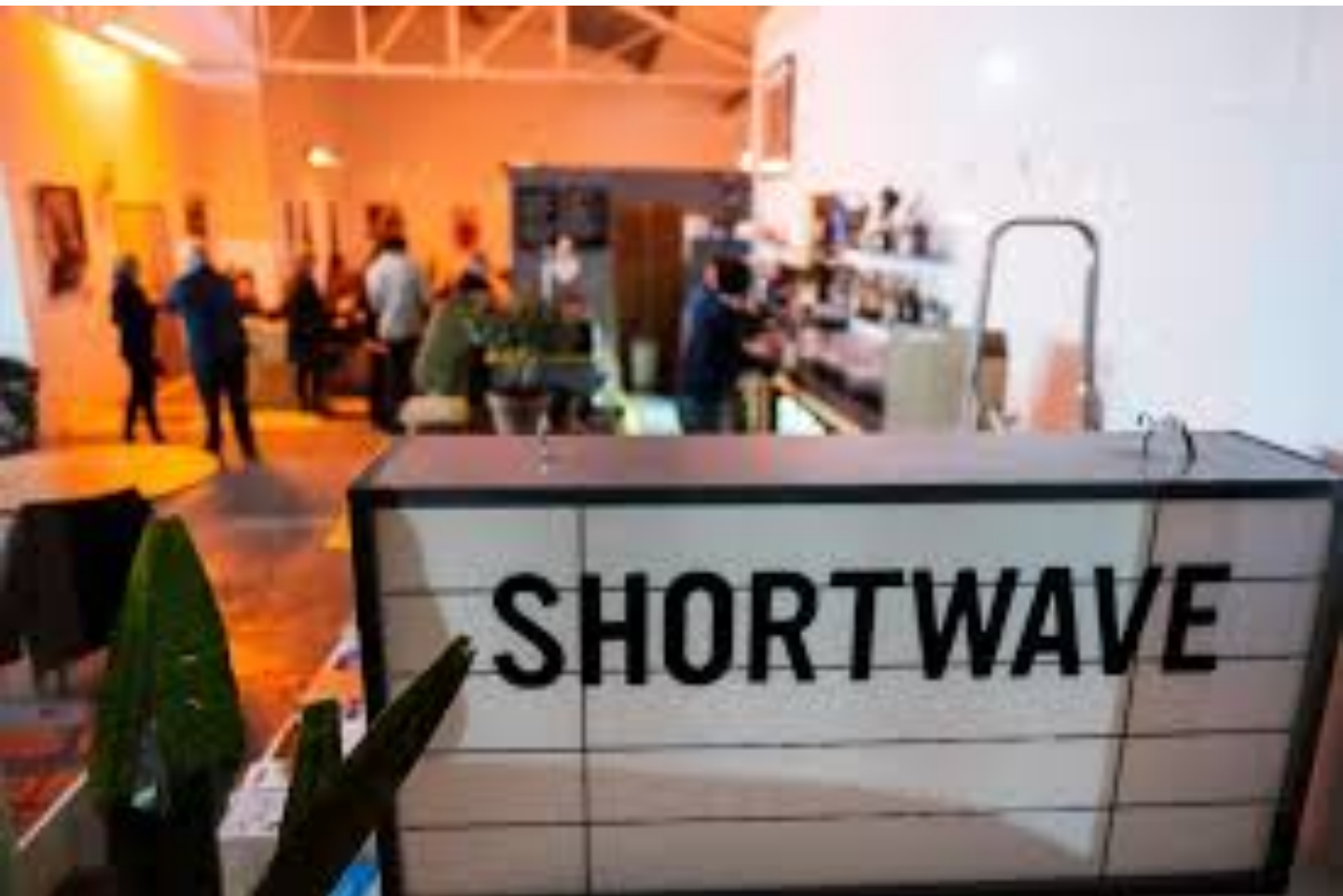
Paul, L, Taylor, S: Exhibition view Women's executive study (painting, mixed media), Little Pink Bush - Digital Film.