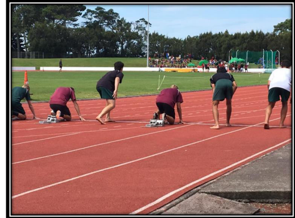
Fig. 1 The start of the 100 m in a secondary school boy's athletics event in Auckland, New Zealand, March 2017

Footwear, particularly that used in repetitive athletic activities, represents an economic cost to communities and is often purchased in the interest of maintaining musculoskeletal health or injury prevention. However, in running at least, the evidence to support the prescription of specific shoe types, with the aim of injury prevention, is inconclusive. [12, 13] Given that the health implications of differences in foot morphology and running kinematics because of growing up shod are unknown, it raises the question should children and adolescents be advised to always wear shoes in circumstances where there is little threat to foot perforation or extreme temperatures? New Zealand is an industrialised country with comparative resources to American and European countries used to study shod populations. However, it appears to be culturally apparent and socially acceptable to conduct activities barefoot. The authors of this paper observed secondary school students (Fig. 1), from an area of high-socioeconomic status,