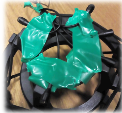
Figure 2. DPA array.

was formed. This hypothesis is based on the notion that the material vehicle is closely related to the musical idea that it bears “musical signification changes substantially when sound materiality is changed” [17].