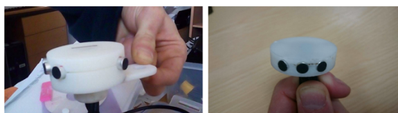
Figure 4. Mounted arrays.

All sound materials collected using the DPA and the electret condenser arrays were treated as 5 channel coherent audio stream sets [18] and were processed using multichannel tracks in a DAW. Original recordings were only processed using