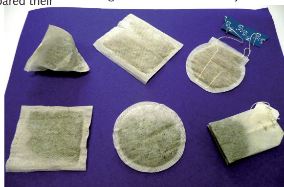
Figure 2 The tabletop teabag display