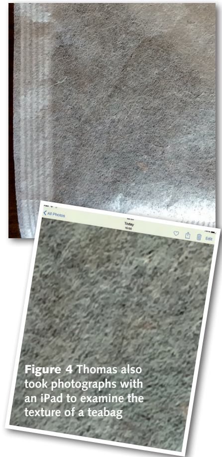
Figure 4 Thomas also took photographs with an iPad to examine the texture of a teabag