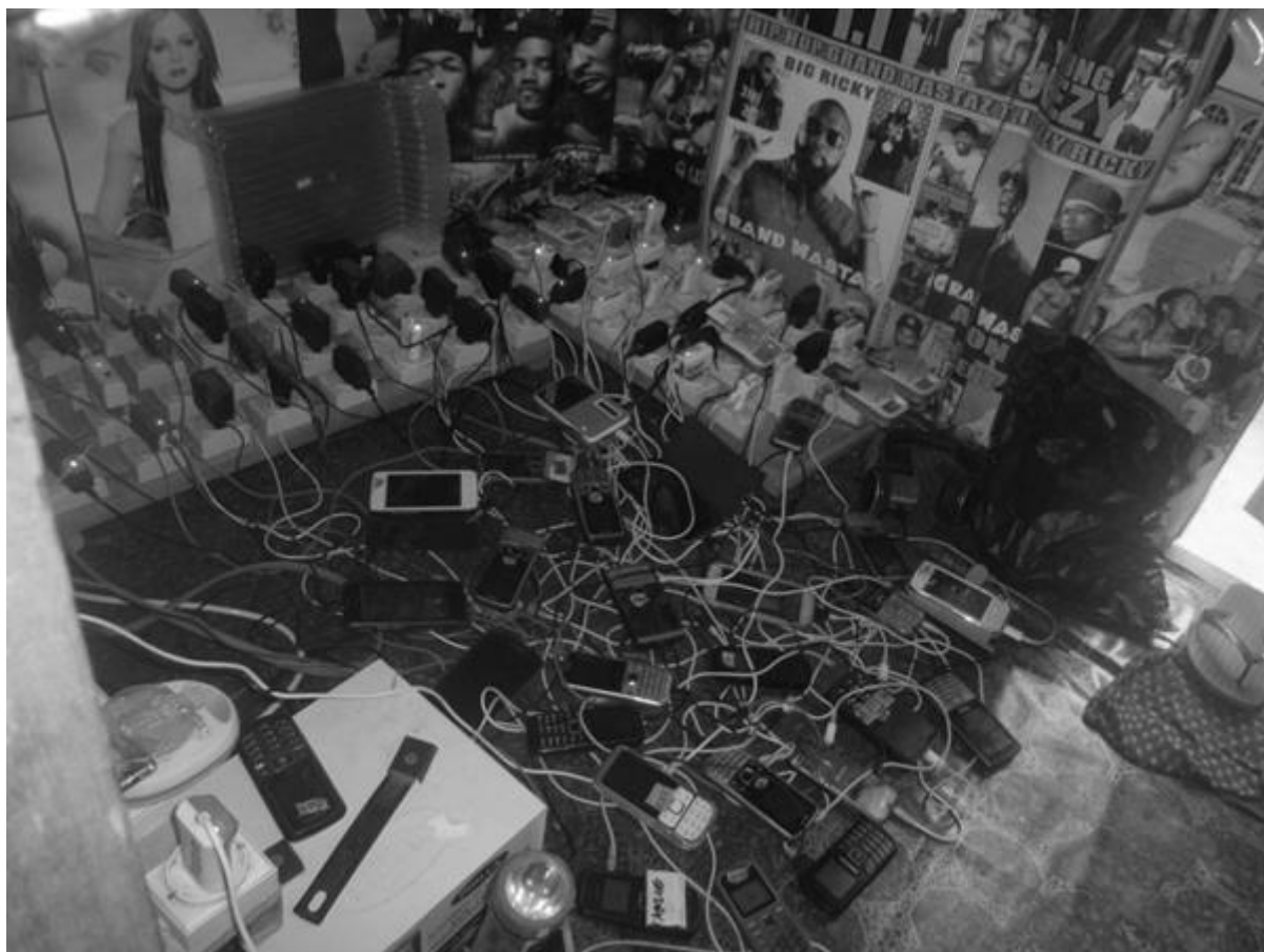
Fig. 2 Inside view of a charging station in the town of Blama, Kenema District, Sierra Leone.