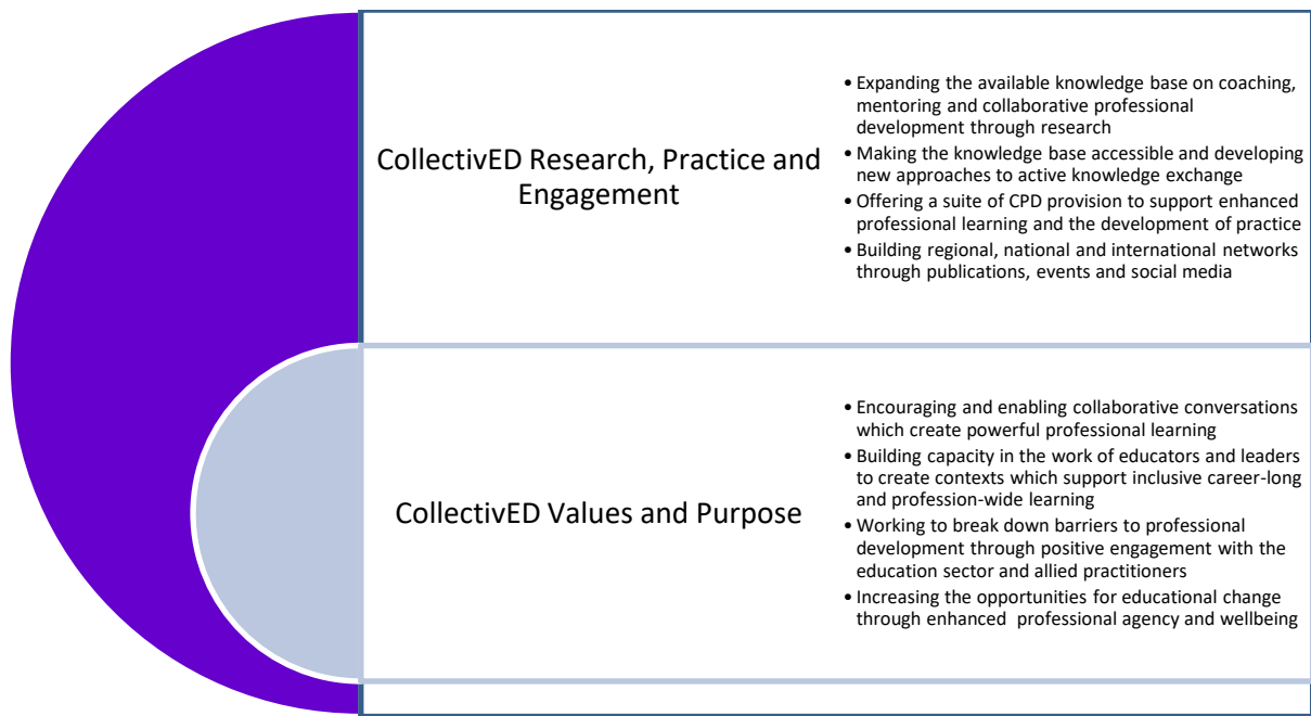
Figure 1 Making sense of CollectivED