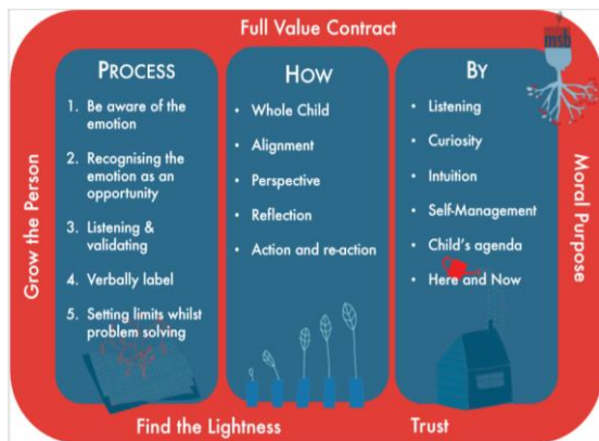
MSB Emotional Coaching Model

context, just wasn't the right fit for our purposes.