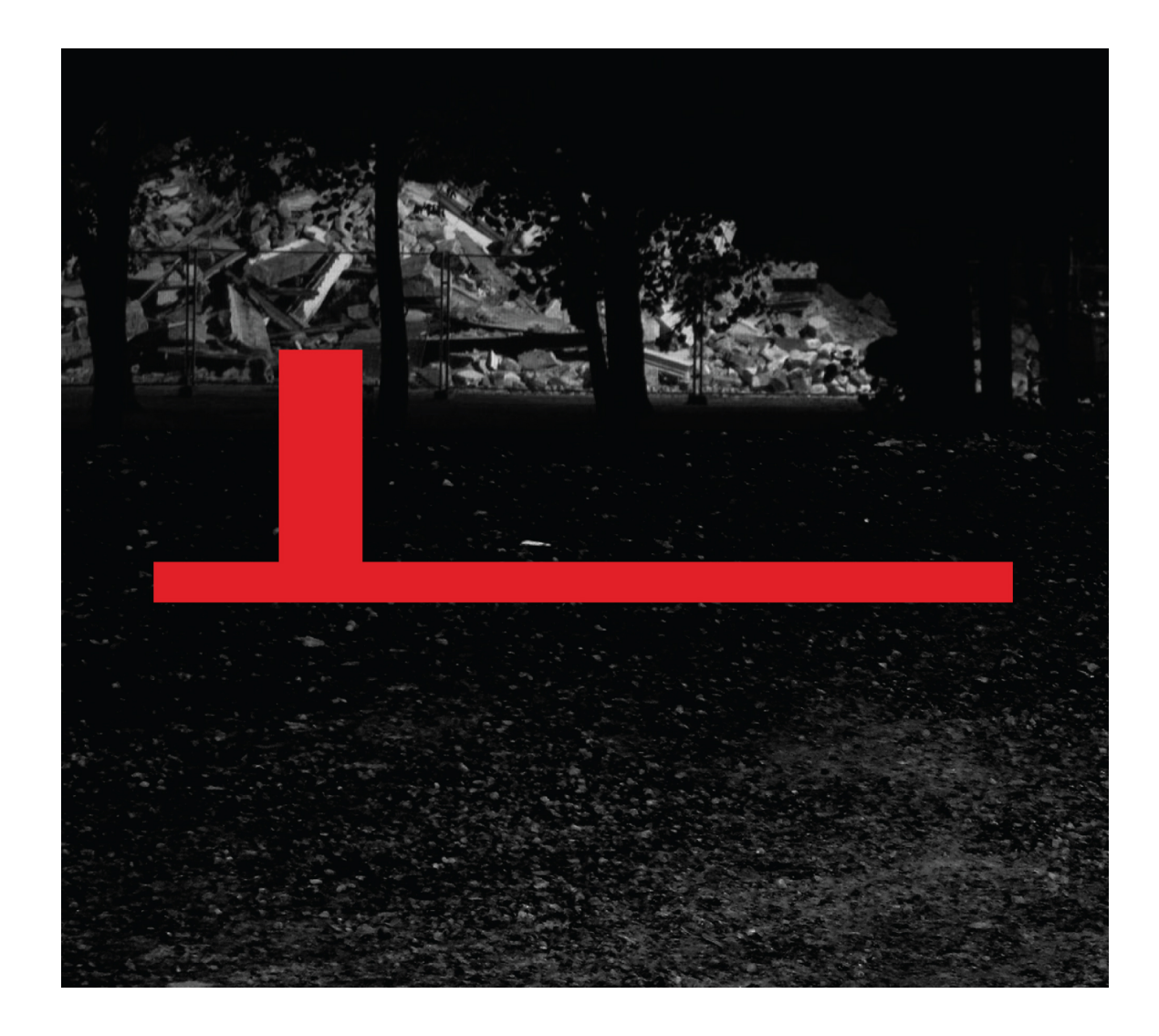
Figure 1. Artists' uses of the word revolution, curated by Alan Dunn, CD sleeve featuring the rubble of a former art school lit up, design by Alan Dunn and Lisa Novak, 2009.

The notion of the 'between' became increasingly important to my research, and I undertook a PhD by Previous Publication (2008-14) entitled The sounds of ideas forming, the relationship between sound art and the everyday. In this context I took the between as a space between A and B into which new cultural activity could be located. In particular I was interested in those spaces within the everyday, such as the commute or high street, and my PhD examined instances of locating sound art into these contexts. An example included my 'Soundtrack for a Mersey Tunnel' CD that was distributed exclusively to commuters of that thoroughfare on bus number 433 (a direct link to John Cage's 4'33"), the same bus I used between home and travelling to Leeds to lecture.