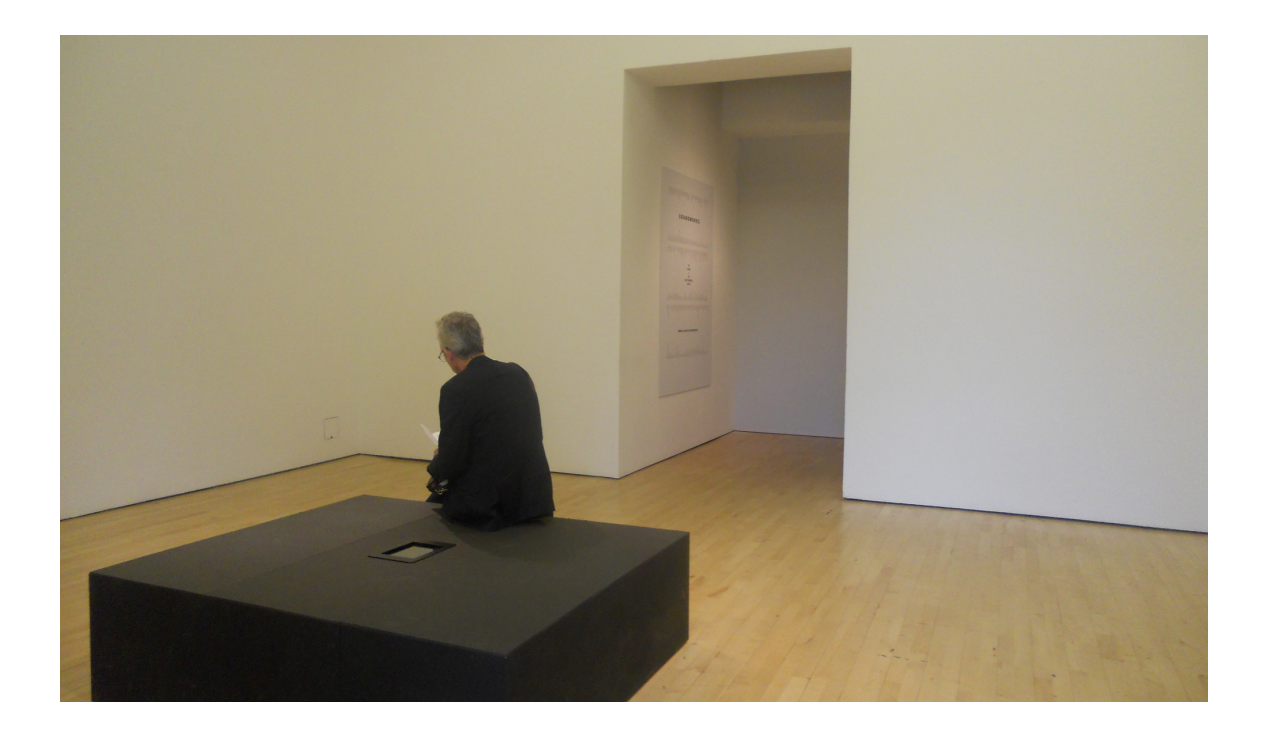
Figure 6. Soundworks, as part of Bruce Nauman's DAYS, ICA, London.