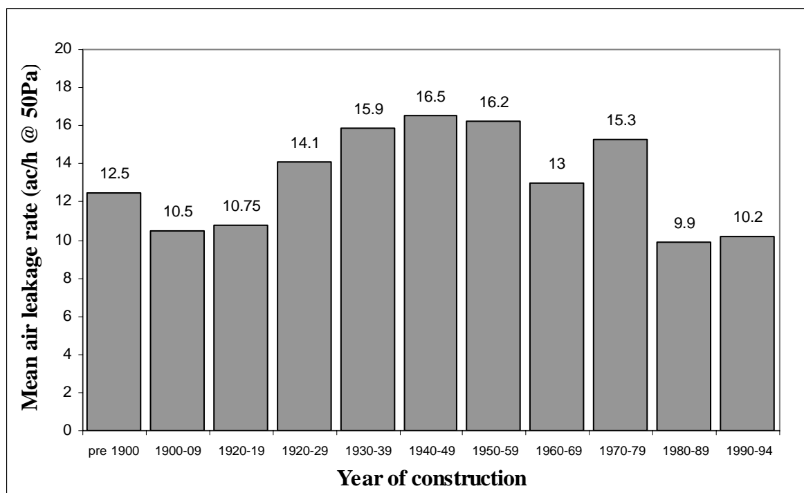
Figure 1 Relationship between dwelling age and air leakage. After Stephen (2000).

There is a commonly held perception that new dwellings in the UK are built to a high standard of airtightness (Olivier, 1999). This is not generally found to be the case. Cohort data contained within the Building Research Establishment's (BRE's) air leakage database 2 suggests that dwellings built between 1980 and 1994 are, on average, as airtight as those built at the beginning of the 20 th century (see Figure 1). Whilst the air leakage data for the older dwellings is not likely to be representative of the airtightness of these dwellings when they were first built, the data suggests that the airtightness of new dwellings has not improved significantly over the last century.