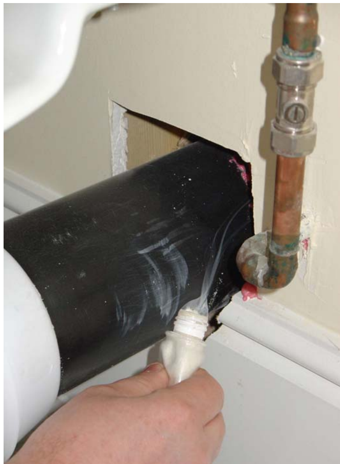
Figure 3 Air leakage around unsealed soil pipe penetration.