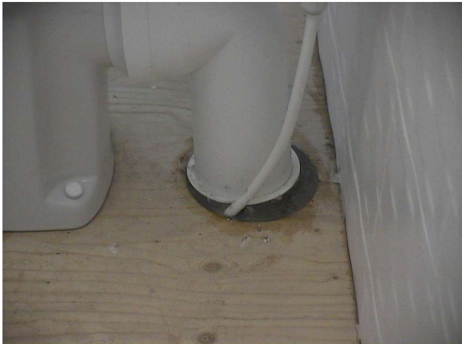
Figure 5 Use of silicone sealant to seal around toilet soil pipe penetration.