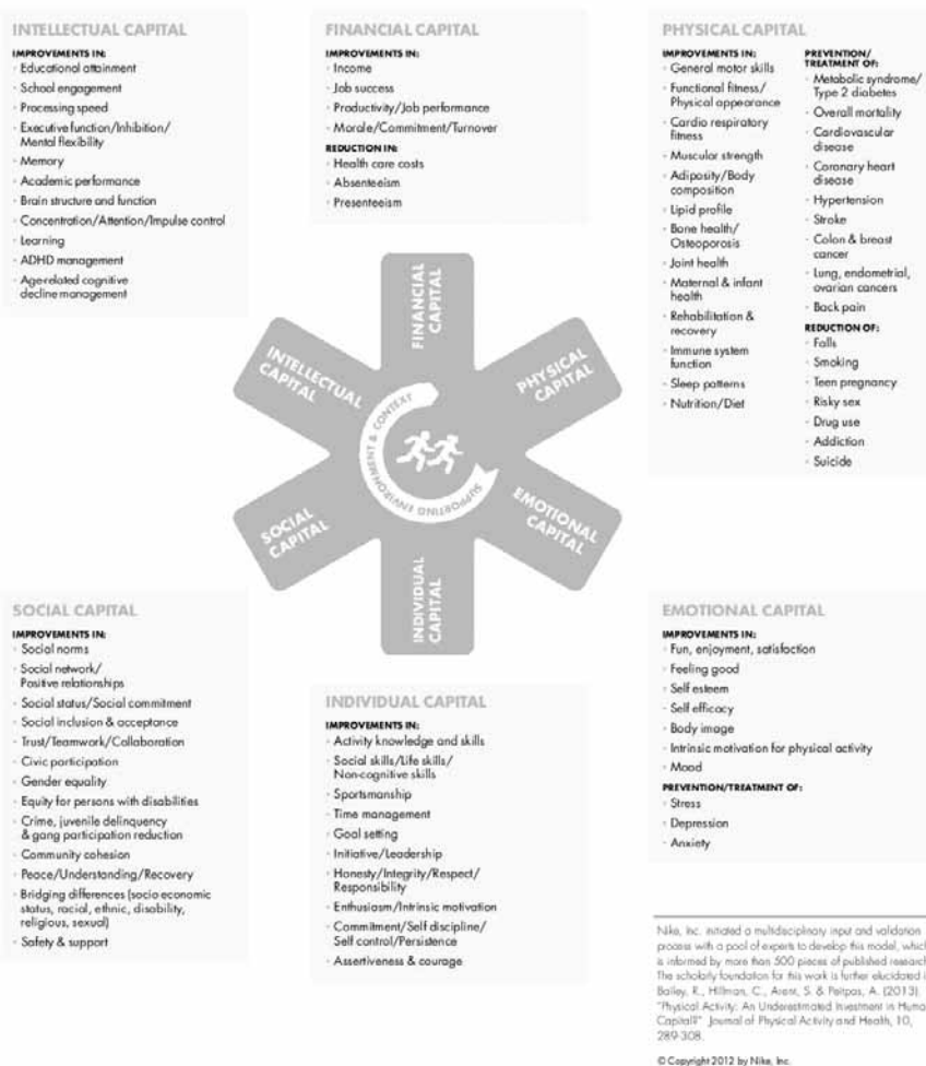
Figure 1: The Human Capitals

The comprehensive benefits of physical activity, sports and physical education are underestimated today. This model shows the spectrum of benefits to an individual and economy. Each "capital" refers to a set of outcomes that underpin our well-being and success.